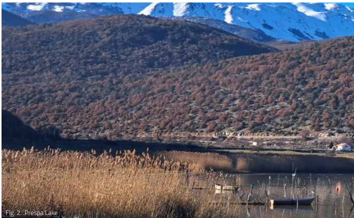
Fig. 2. Prespa Lake

converted into warehouses, and the icons were left behind. With the individual efforts of certain people, some of whom were professionals in their field, some of these monuments, as icons, in the 80s, were allocated in the premises of the newly established Museum of Medieval Art in Korche, which enabled their preservation.