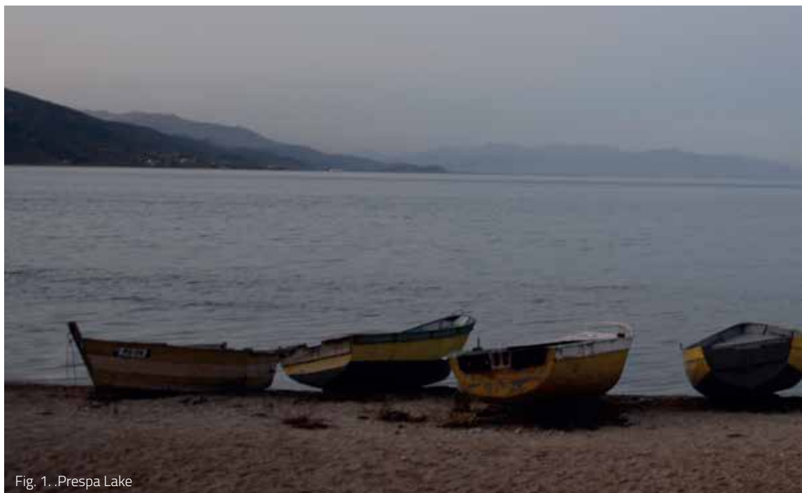
Fig. 1. .Prespa Lake