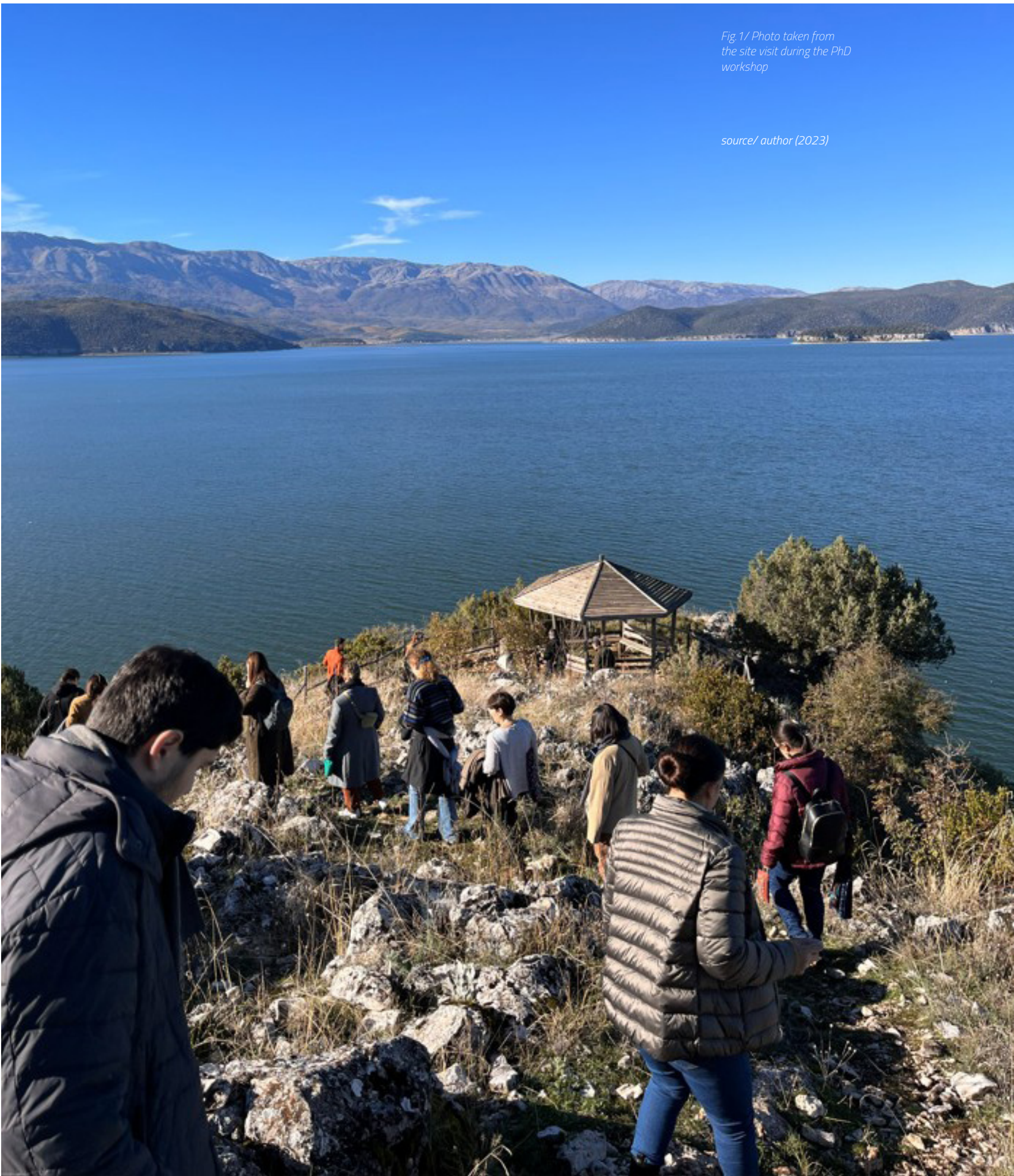
Fig. 1/ Photo taken from the site visit during the PhD workshop