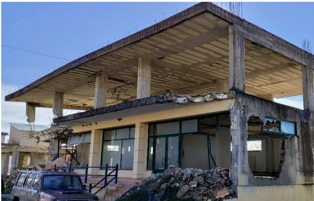
Fig2 / Example of semi-finished building in the Finiq municipality source /