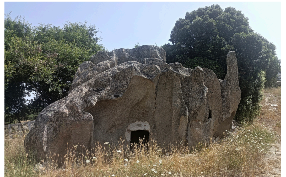
Fig3 / An example of Domus de Janas in the territory of Buddusò source /

terior environments (Hayashi, 2004), defining the representation of the city's face. The different visual elements of Façades can generate different feelings and emotions in the people in contact with them: