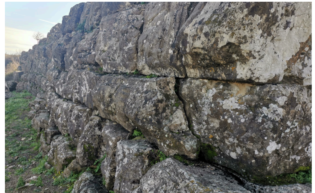
Fig6 / Left - view of the limestone fortification walls of ancient Phoenice in the archaeological park of Finiq, Right - the limestone stands in the theater at the Butrint archaeological site. source /

sic-Lower Cretaceous, occur in Krasta-Cukali and Mirdita Zones; Young Flysch (Maastrichtian-Eocene), that was formed in Krasta-Cukali and Albanian Alps. In the External Albanides (Kruja and Ionian zones) these turbidites deposits belong to Oligocene age and are widely spread on the surface with a total thickness varying between 1000 m and 3000 m.