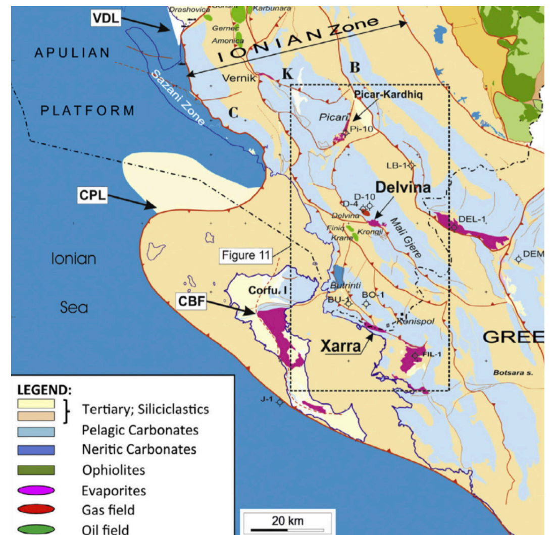
Fig5 / Simplified map of the Mesozoic carbonate platforms in southern Albania emphasizing the occurrence of the Triassic evaporites as well as the position of the oil and gas fields in the Ionian fold-and-thrust belt