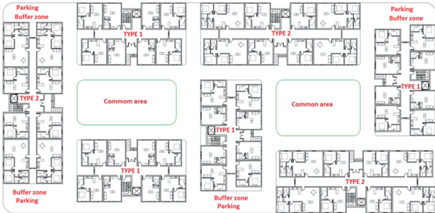
Fig. 2. Social housing proposed model; Type 1 – Studio and 1 BHK; Type 2 – 1 BHK and 2 BHK.

different spaces. Subsequently, the two-bedroom unit occupies an area of 84 m 2 to accommodate a larger household. Similar to previous units, it also consists of an open kitchen and living layout with two bathrooms, one attached to the master bedroom. All units have windows located in each living and bedroom space that allow in ample natural light and offer views of the neighbourhood or communal areas. The blocks (Type 1 and Type 2) can be configured based on the available land plot.