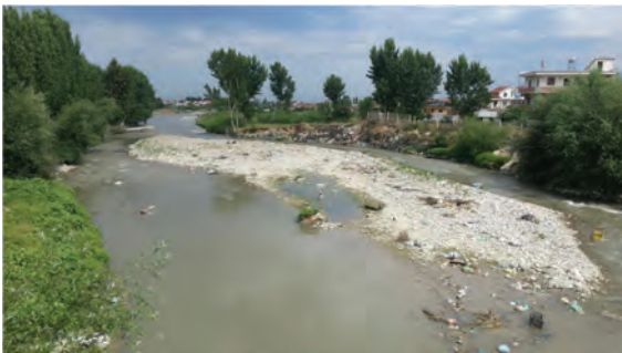
Fig. 2 Photo of Tirana River.

The overall vision of the Tirana-Airport triangle opens this area and integrates it with the city, through new infrastructure and public transport. But, it provides public transportation only in the borders, in correspondence to the main axes, with the intention of preserving the quiet character and natural landscape of the area (mainly in the semi-urban border). Thus, the infrastructure interventions in this area should be minimalistic: dual carriageway that horizontally connects