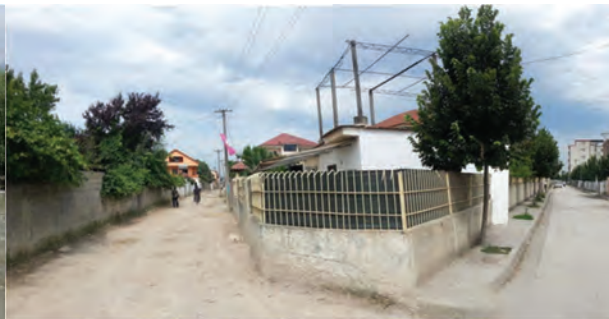
Fig. 3 Photo of the informal area.

own biotopes, ecosystems and landscape dynamics. (Alfsen-Norodom, 2004). In fact, this is part of the watershed of Tirana River (or Ishmi river) with environmental importance particularly regarding the flora and fauna.