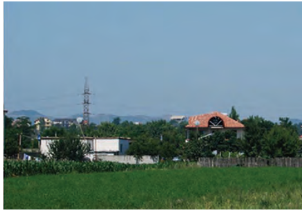
Fig. 6 Photo of the area: water tower .

In this sense Christian, D defines eco-villages as communities building ecological sustain-