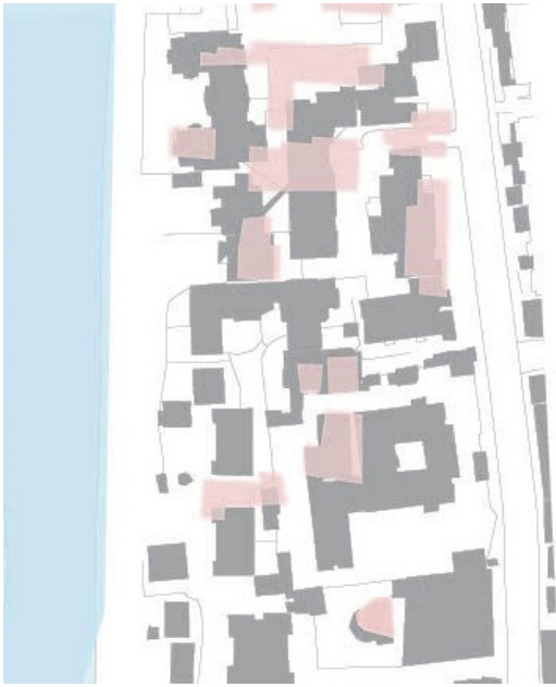
Fig. 4 / Plan of intervention with textile shelter, area 2, Lezhe. Author Source