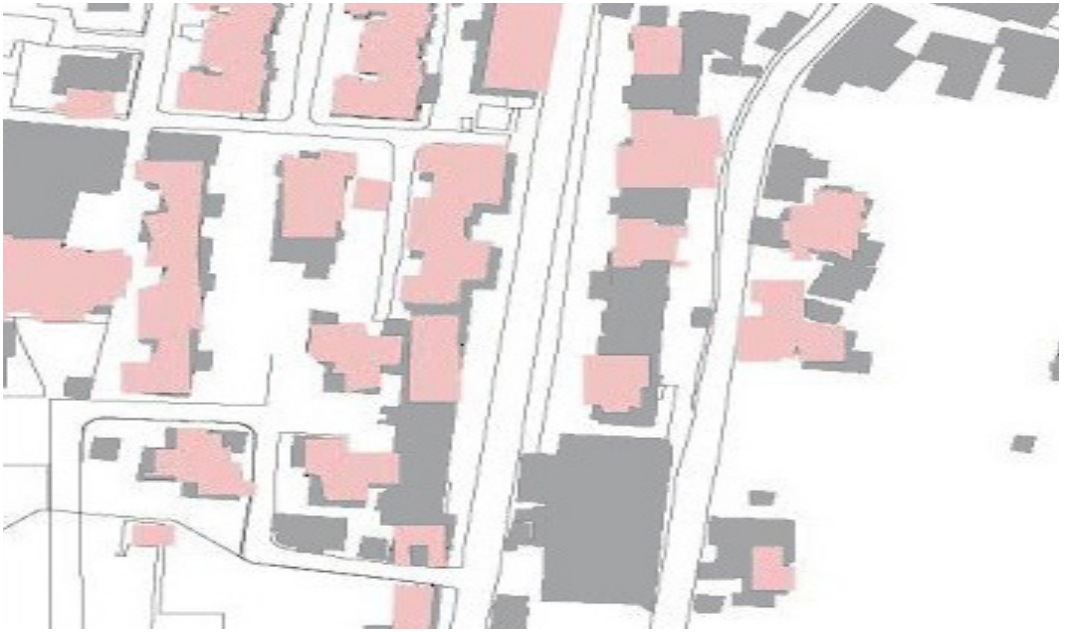
Fig. 3 / Plan of intervention with textile shelter, area 1, Lezhe Author Source

are: low cost, adaptation to different sizes, direct impact on protection from UV radiation, protection of the facade from wind or rain. Studying the city of Lezhe closely, we found that it has a diverse climate where the sun is present for most of the year and is also accompanied by strong winds and torrential rains. According to these descriptions, it is understood that the intervention in the facade is not only an aesthetic and identifying element for the area, but also a functional one because it will help in the best possible performance of the facades. Interventions with textile elements will be designed only for residential houses, not for public buildings.