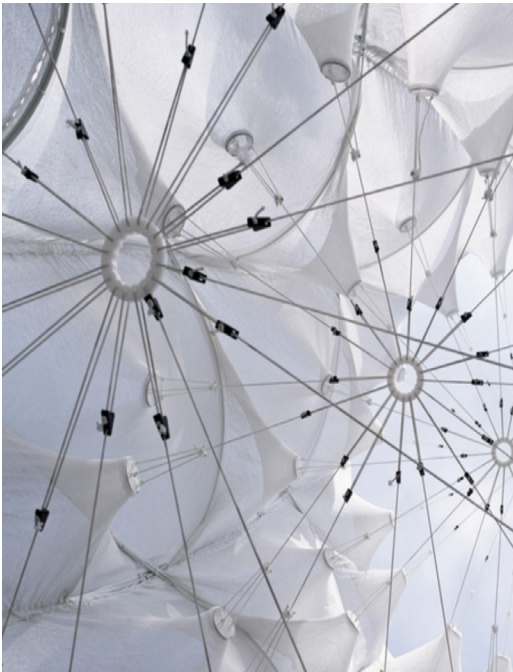
Fig.1/ Textile Shelter . Source/ The Royal Danish Academy of Fine Arts