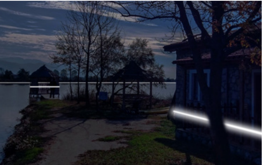
Fig. 5 / Photo-montage of the proposed intervention in the lagoon of Kune - Vain, Lezhe. 2#

And no longer that a line becomes a visual metaphor of the change in the landscape as we know it, the observer immerses himself in the change becoming aware that such a reality is not a mere hypothesis but a certainty if man does nothing to preserve it.