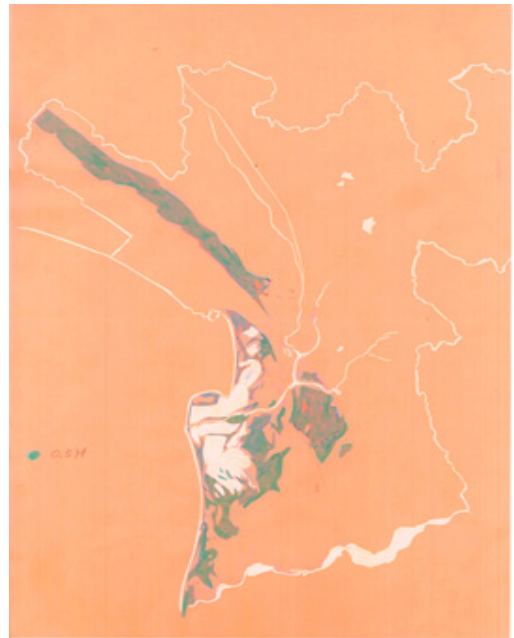
Fig. 2 / Artistic interpretation of the land that is risked by flooding in Lezha municipality. Courtesy of the Artist.

internal characters of the region itself. One of them is the Kune-Vain Nature Reserve, a wetland system located in the administrative district of Lezha. The area includes the Kune side on the north of the Drini river in Lezha and of Vain to the south of the river. From the total area of the Kune Vain area (excluding the Tale area and the Kenala lagoon) is about 2000 ha. Kune Island (part of the Kune slope) is a strictly protected area. Area and according to Albanian environmental legislation, tourism cannot be applied there. The area is bordered by Shengjiin beach and the island of Shengjiin village, Lezha island village, Tale village and Tales beach, etc. (Kreci & Sinojmeri, 2017)