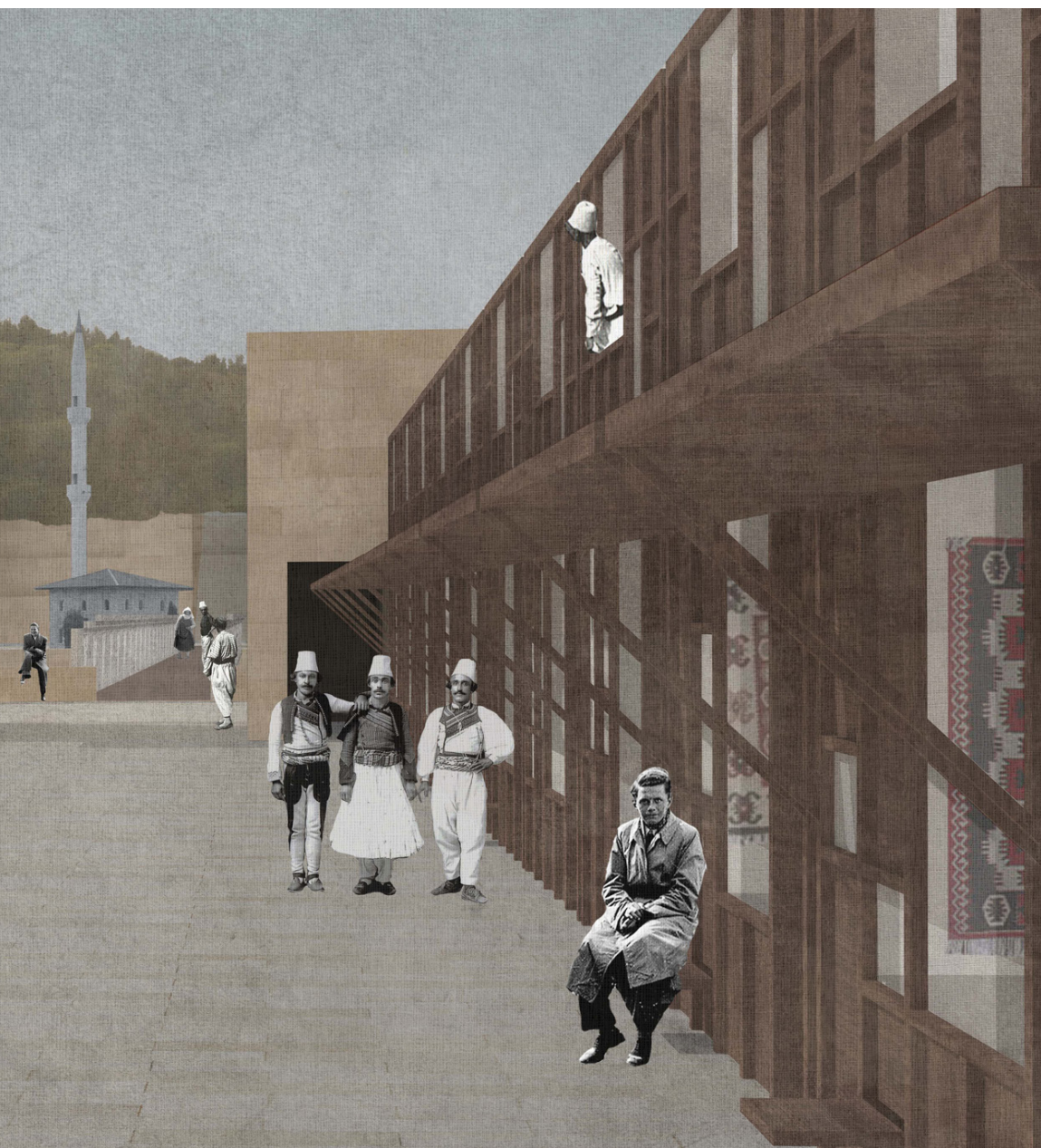
Fig9 / Design of the new bazar of Shkodra