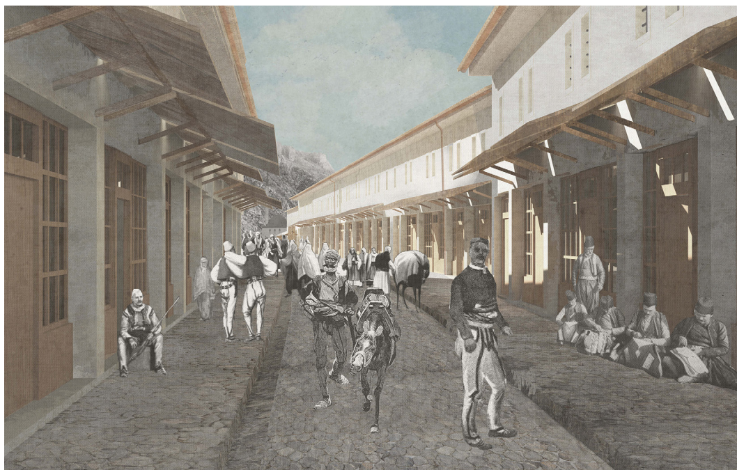
Fig1 / Reconstruction of the ancient bazar of Shkodra

cities built on their banks, is a condition of primary interest in the Albanian territory. Shkodra, located on the shores of the largest lake in the Balkans, in an area of transition from the Adriatic coast to the mountainous landscape of the Albanian Alps, is the most important "lake city", in which deep relationships among urban, natural and rural landscapes, among the forms of water, agricultural structures and forms of urban settlement, are recognized. In this sense, the interpretation of the boundary between city and water is an opportunity to give identity to those marginal spaces assuming them as constituent and identifying parts of the urban form of Shkodra.