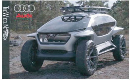
Fig. 4 / Audi off-road autonomous electric vehicle concept car.