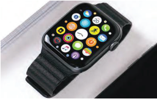
Fig. 3 / Modern wearable device.