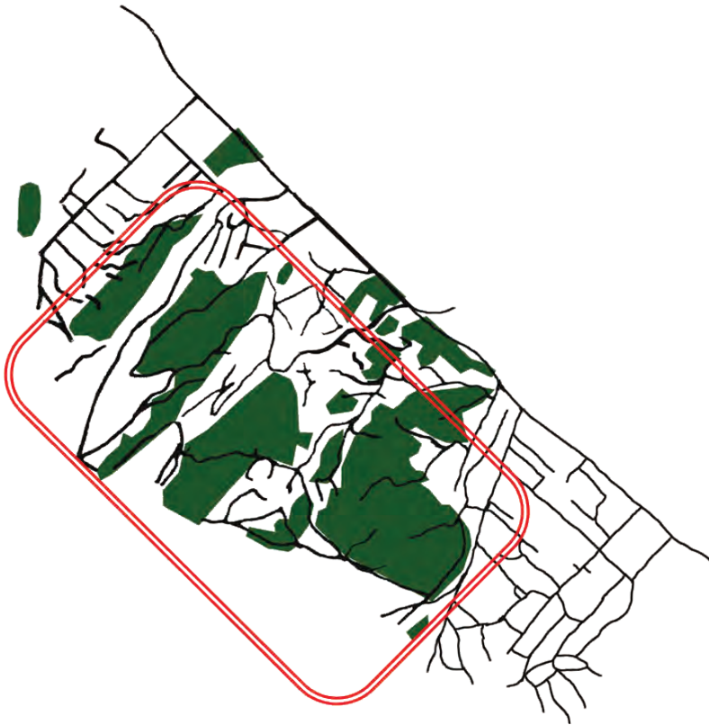
Fig. 5 / "The Green Zebra" surrounded by a red border

(and a portion on a strip parallel to the National Road and the river axis).