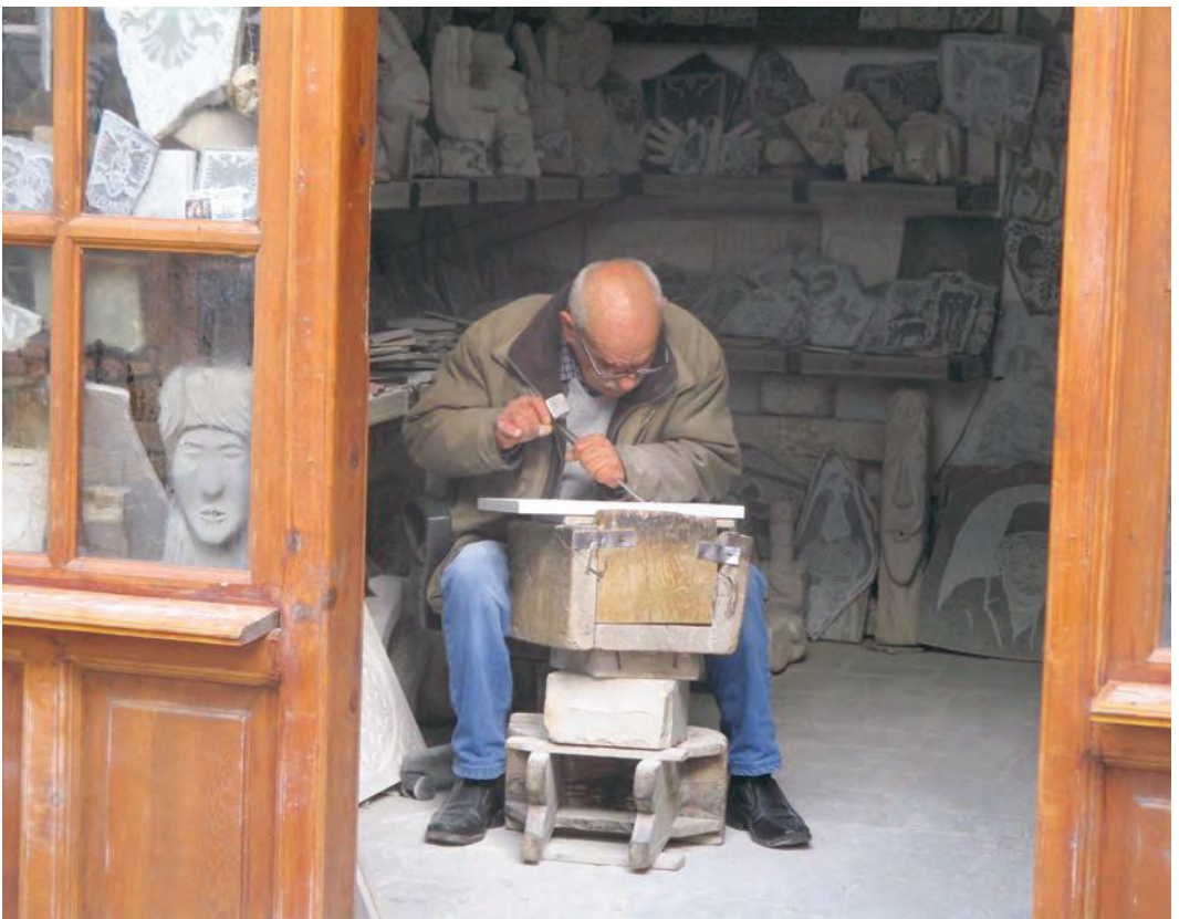
Fig. 2 / Local artisan working stone.