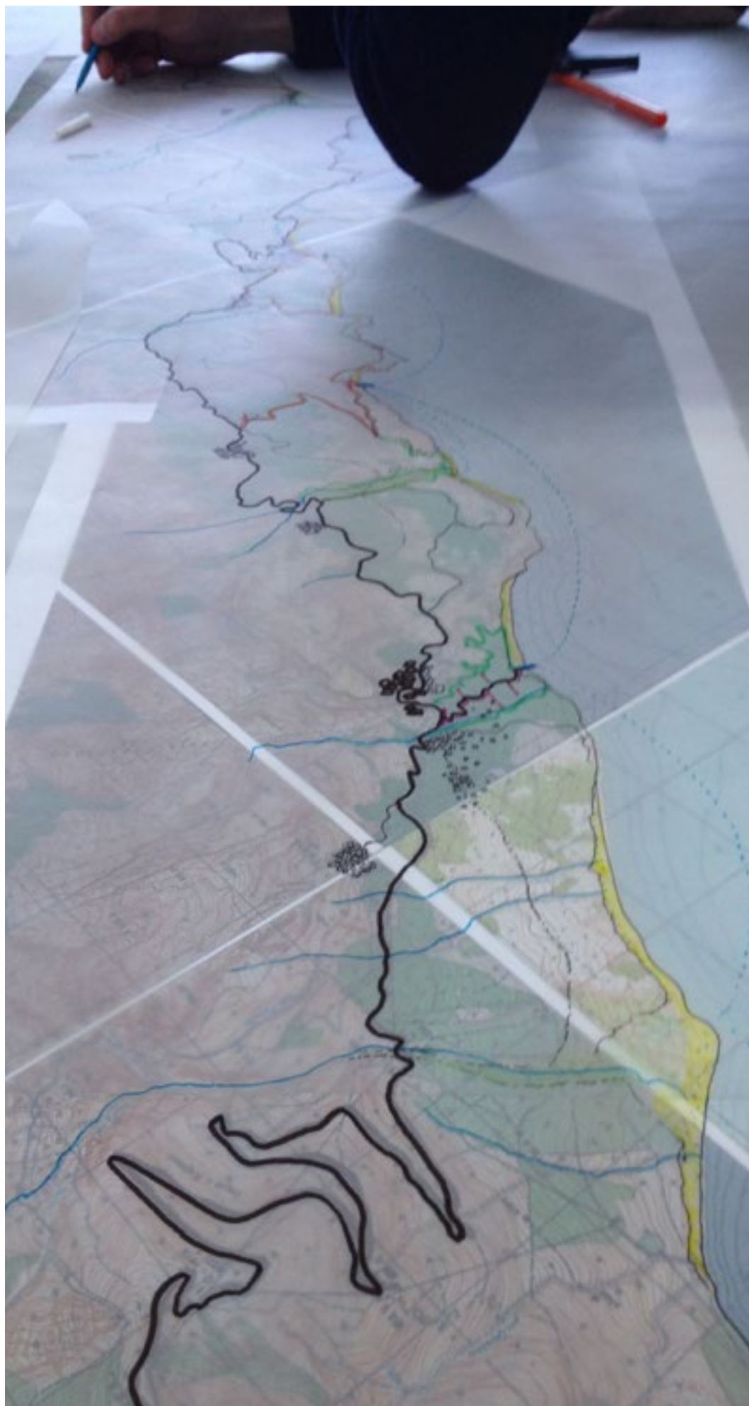
Fig1 / Drawing elaborated during the Riviera workshop by the students of Ferrara and Tirana source / PhD international workshop students