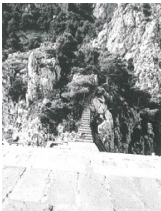
Fig3 / Villa Malaparte, Capri. Arch. Adalberto Libera 1938. source / Marco Ferrara, Adalberto Libera - Casa Malaparte a Capri