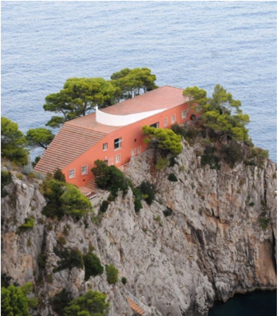
Fig5a,b,c / Villa Malaparte, Capri. Arch. Adalberto Libera 1938