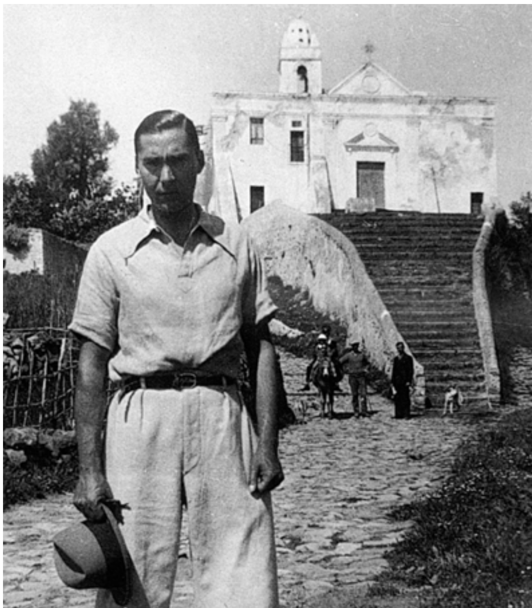
Fig4 / Curcio Malaparte facing The Annunziata Church in Lipari Sicily 1934 source / Adalberto Libera: Casa Malaparte a capri: 1938- 1942