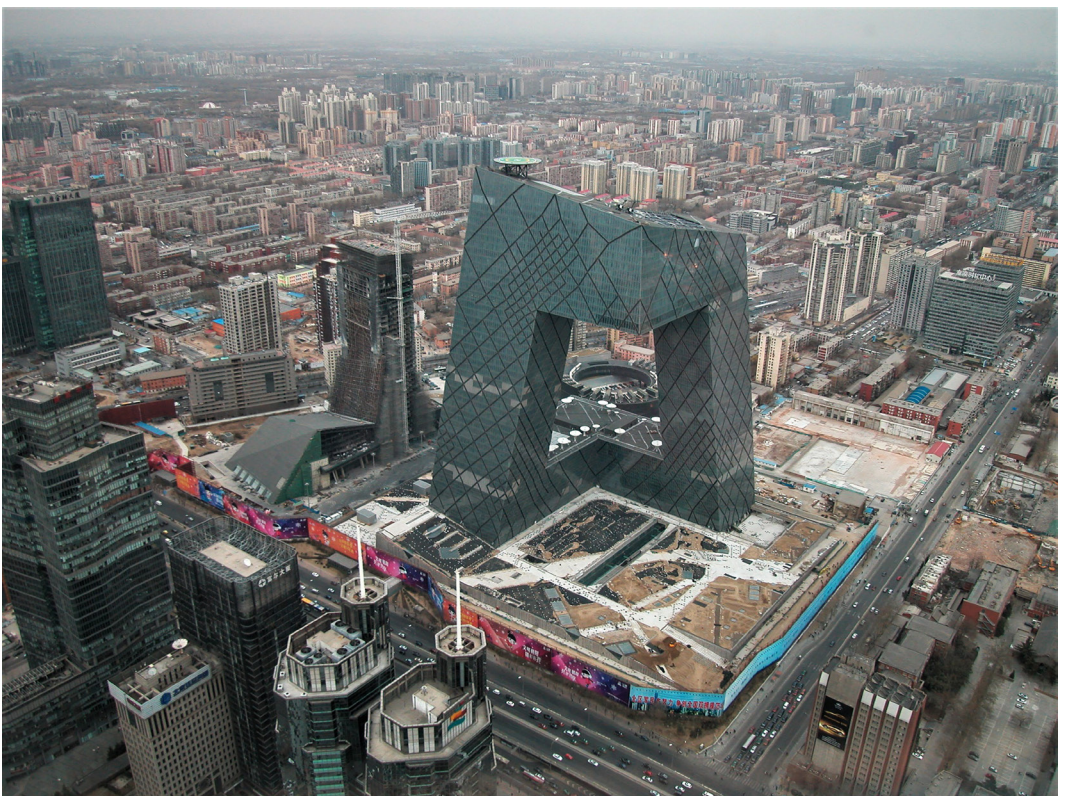
Fig6 / Pechino Source / author

In this sense the case of Prishtina is certainly a city that could well represent, in a translated and metaphorical sense, the "liquidity" of which Bauman treats. This is due to its characteristics of a city that is anything but dense and devoid of a single polarity but with different and multiple internal polarities, in many cases more connoted as empty than full urban ones, think for example of the library area, which they make it an excellent testing ground for this new approach to urban regeneration and transformation.