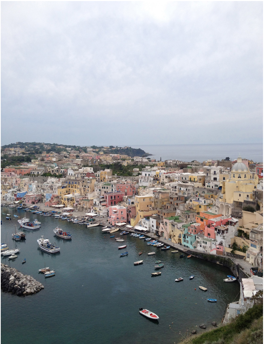
Fig3 / La Corricella , Procida (Napoli,Italia) Source / author

The city excerpts made according to the dictates of these great examples of modern cities, especially in the case of Le Corbusier and Hilberseimer, (Hilberseimer L. ,1927) have indeed given the impetus, with their failure, to the final renunciation of the modernist ideal and it is no accident that the post-modernity in architecture is emblematic starting from a precise event concerning the demolition of the residential complex of Pruitt Igoe built between 1954 and 1955 according to the dictates of the ideal cities mentioned above, by one of the