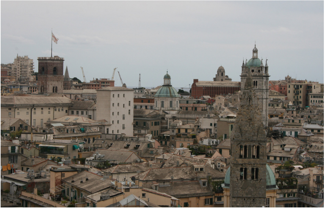
Fig1 / Genova Source / author

great story of the city, in post-modern society, was theoretically abandoned in favor of a fall back on the city seen as a simple summation of architecture (small stories). If the man of post-modernity is no longer able to face and conceive a new great story, unlike his modern predecessor, the architect of post-modernity is no longer able to understand and govern the processes of transformation of the city as a whole and coherent organism.