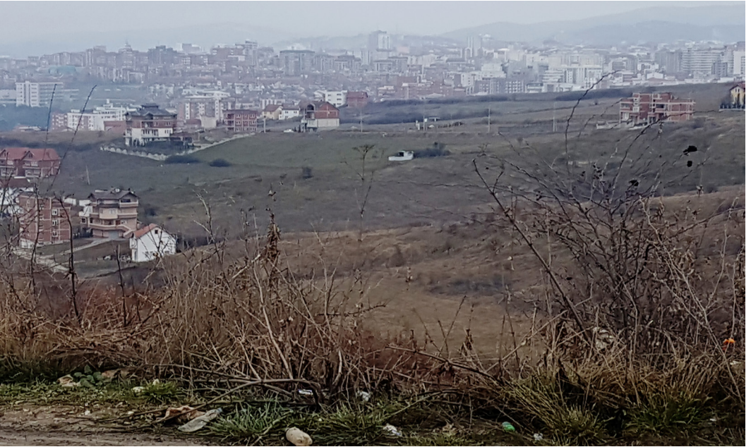
Fig4 / First suburbs of Prishtina, the city is expanding without an effective urban planning.