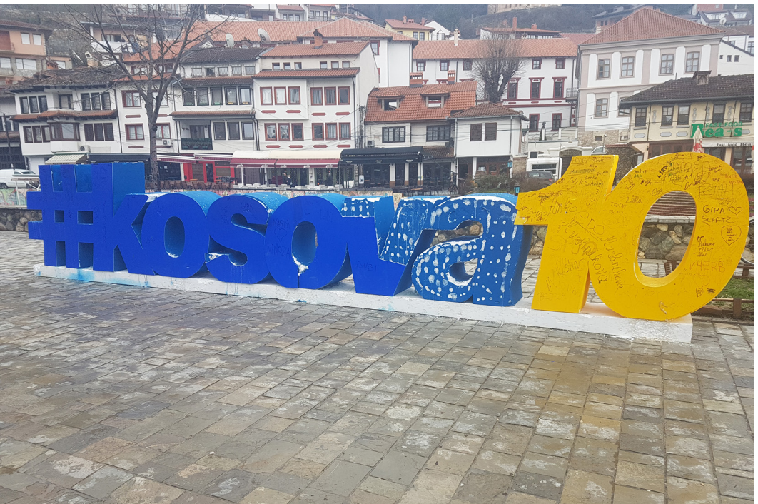
Fig3 / Installation in the city center of Prizren for the 10th anniversary of Independence of Kosova .

potentials towards the creation of an inclusive and sustainable future perspective, becoming a competitive capital of the Balkans region. Indeed, Prishtina has a great underdeveloped potential, which shall be identified and used as the base for cultural, social, urban and economic development (Archis, 2010). Some of the potentials identified by the author are: