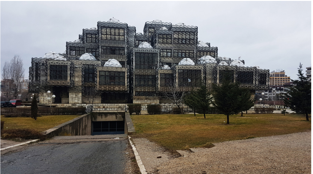
Fig5 / The public library of Prishtina.

to be encouraged in continuing studies; young students need to have international experiences at high levels and university needs more space, funds, facilities and professors to make Prishtina an important center for research and academic education. Even the healthcare system needs to be improved to face problems related to pollution and to give a better living to the population.