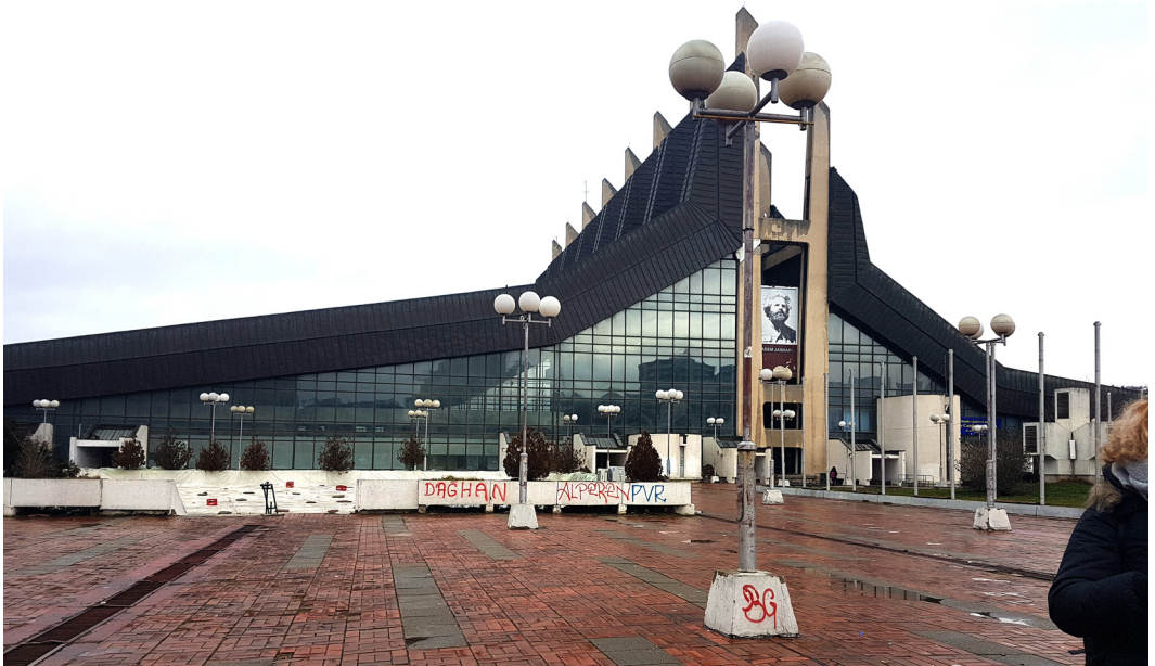
Fig6 / Palace of Youth and Sports, Prishtina, Kosova .

enrich the cultural heritage of Kosova . Other categories of users that need a special support are elderly, disabled persons, and all people needing special assistance; the public administration has to provide them appropriate services, facilities and public spaces.