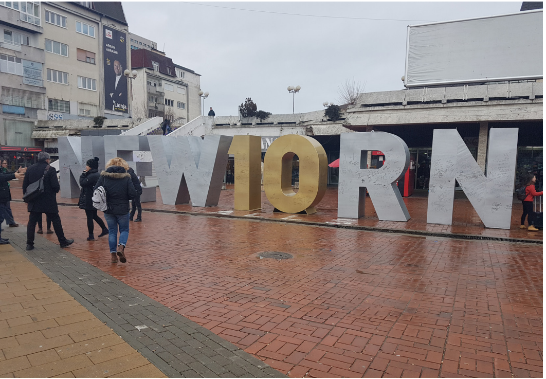
Fig2 / Installation in the city center of Prishtina for the 10th anniversary of Independence of Kosova .