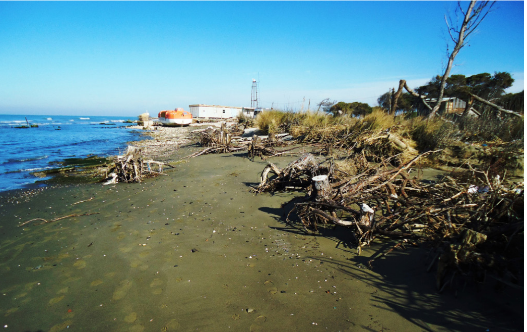
Fig3 / Trees uprooted by sea erosion

– TAP is another current threat. For the Semani watershed, within 500 meters of the route corridor of the TAP project affected land were identified in total, 5,730 hectares of agricultural land, 2,850 hectares of forest, 1,400 ha of pastures and 347 ha of urban area. The pipeline passes through some natural reserves and monuments of nature, and the last 2.7 km before entering the sea through the estuary of Seman-Pishë Poro, which is a CORINE biotope, all these of major importance for nature conservation. (Plani Kombetar per Projektin TAP).