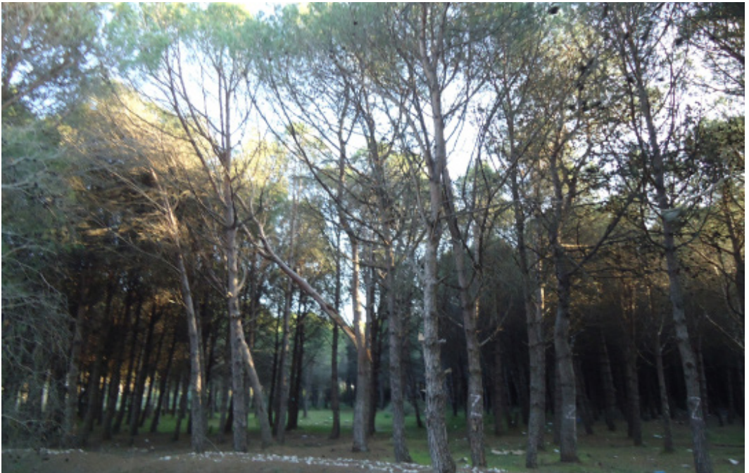
Fig1 / Semani pine forest

Semani basin are explained, including here also a great number of species and ecosystems (coniferous forest, shrubs and wetlands, plant and animal species). Biodiversity surveys are undertaken to find out what organisms exist in a given area, for monitoring endangered populations, evaluating conservation priorities and bioprospecting.