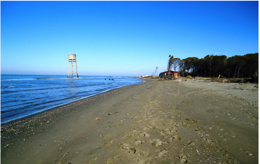
Fig 2 / The erosion of Semani seashore

ongoing process. In addition, the frequency of flooding and the negative impacts of sediment deposition are on the increase.