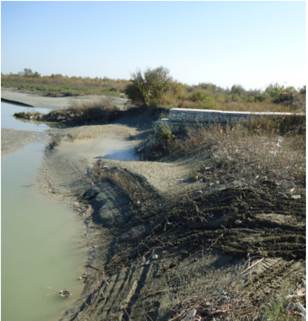
Fig6 / Constuction for Semani riverbank protection