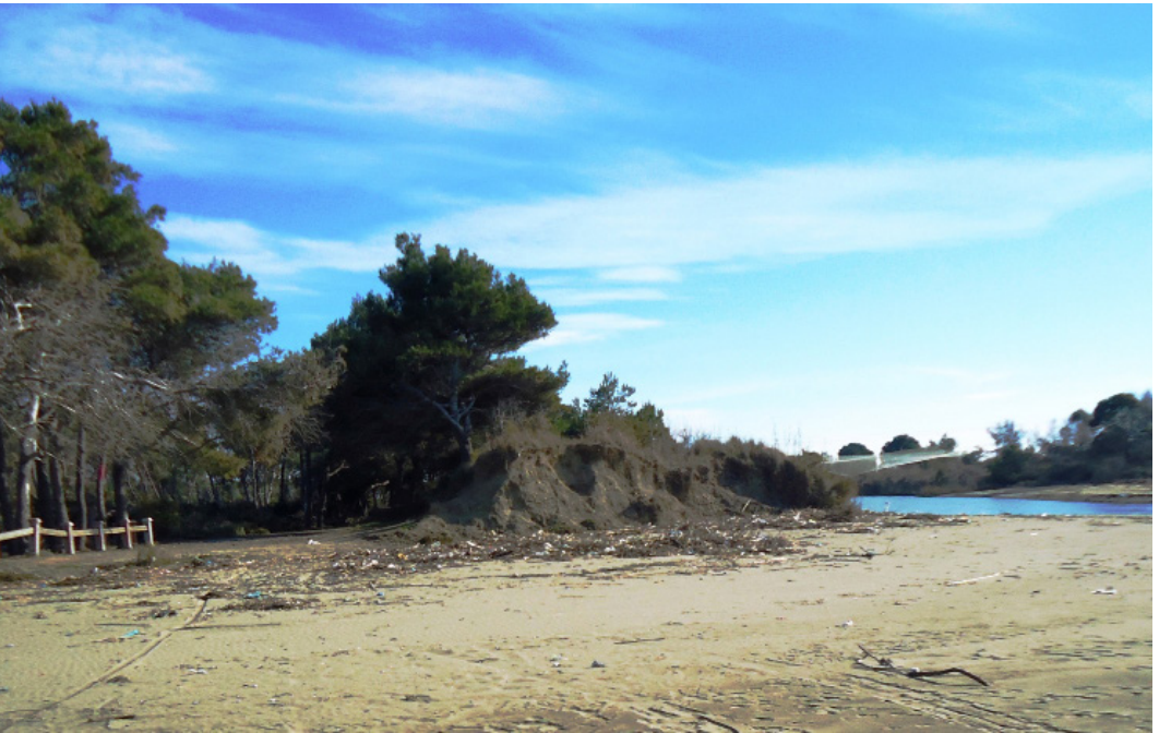
Fig5 / Destruction of dunes

Some good management practices can be extended specifically in mountainous and plain areas, including preparation of restoration projects with integrated technical and biological measures; maintenance of dikes and protection works along the river (penels, gabions). maintenance and cleaning of drainage system; afforestation of deforested and bared land on riverbanks and coastal area with suitable species; stop spontaneous gravel and sand mining; establishment of forest protection belts on both sides of the river 100-200 m wide in order to protect that from damages; ensure participation of local community, local government and interested parties (Muharremaj, 2001).