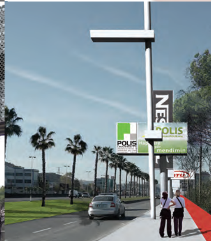
Concept MetroPolis Studio 2010, Reactivating Durana Railway Connection