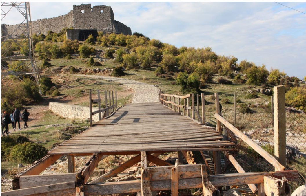
Figure 2. Castle View.

yet unexploited and unexplored tourism potential. By fostering mountainous, archaeological and historical tourism, besides building touristic villages and tourist ports along the coast, the Regional Development Strategy aimed at reducing the unemployment rate and the percentage of families receiving economic aid (Regional Council, 2005). Also more recent contributions and documents continue to highlight the importance of tourism for Albania's development, such as Albania 2030 Manifesto (Aliaj et al., 2014), the National Strategy for Development and Integration (2014-2020) and the Sustainable Tourism Development Strategy (2018-2022). In fact, touristic initiatives could be particularly important in terms of shifting attention and investments towards local resources (Ciro, Toska, 2018).