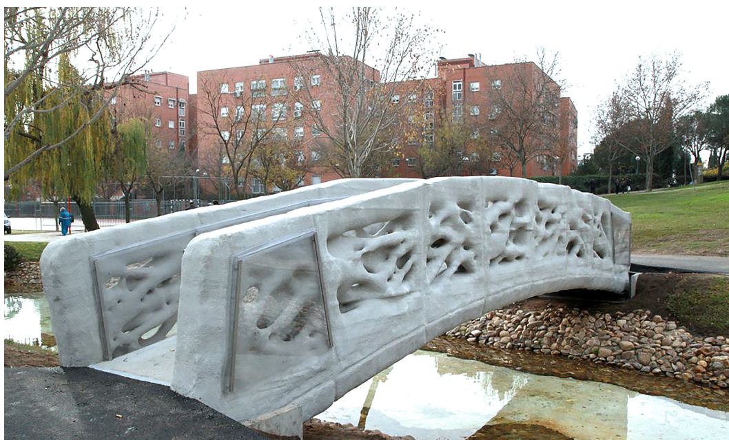
Fig4 / The 3D printed pedestrian bridge experimented in Madrid by Dshape and IAAC, through powder-bed deposit processing. It represents the first landscape component realised by the application of large-scale rapid prototyping.

water to run over coastal lands, suburb areas, and the city centre [Fig.4].