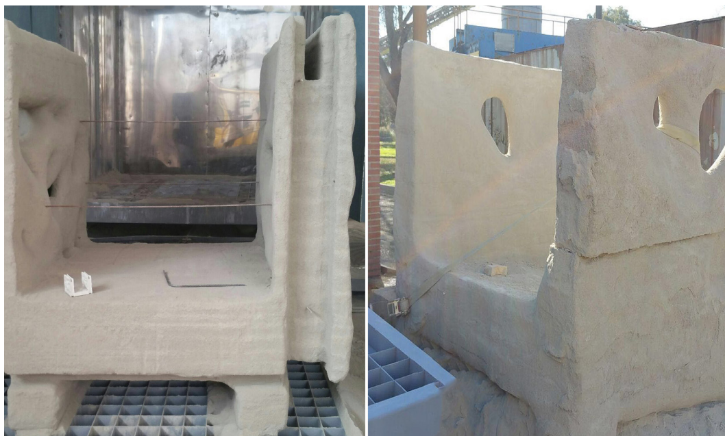
Fig5 / Sections of the 3D printed pedestrian bridge. The organic-shaped volume follows forms of nature with the aim of optimising the mechanical performances and the use of resources by recycling the raw material during manufacture source / photos of Dshape