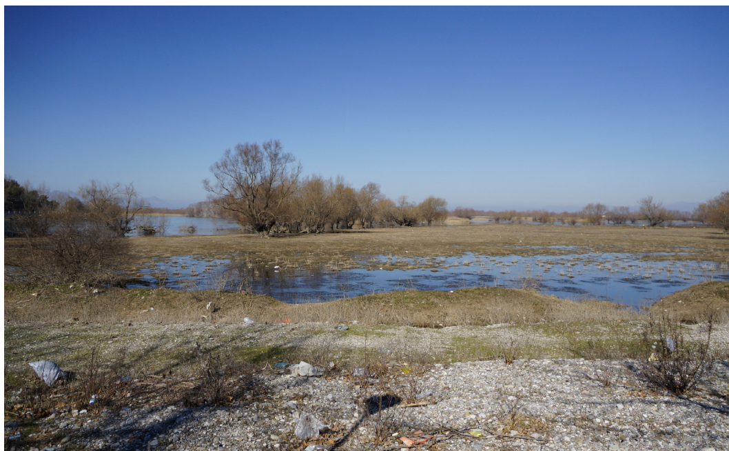
Fig1 / A lagoon area of Shkoder's Lake, in a current state of degradation. The wetland has an unexploited landscape potential because the context lacks of updated territorial policies