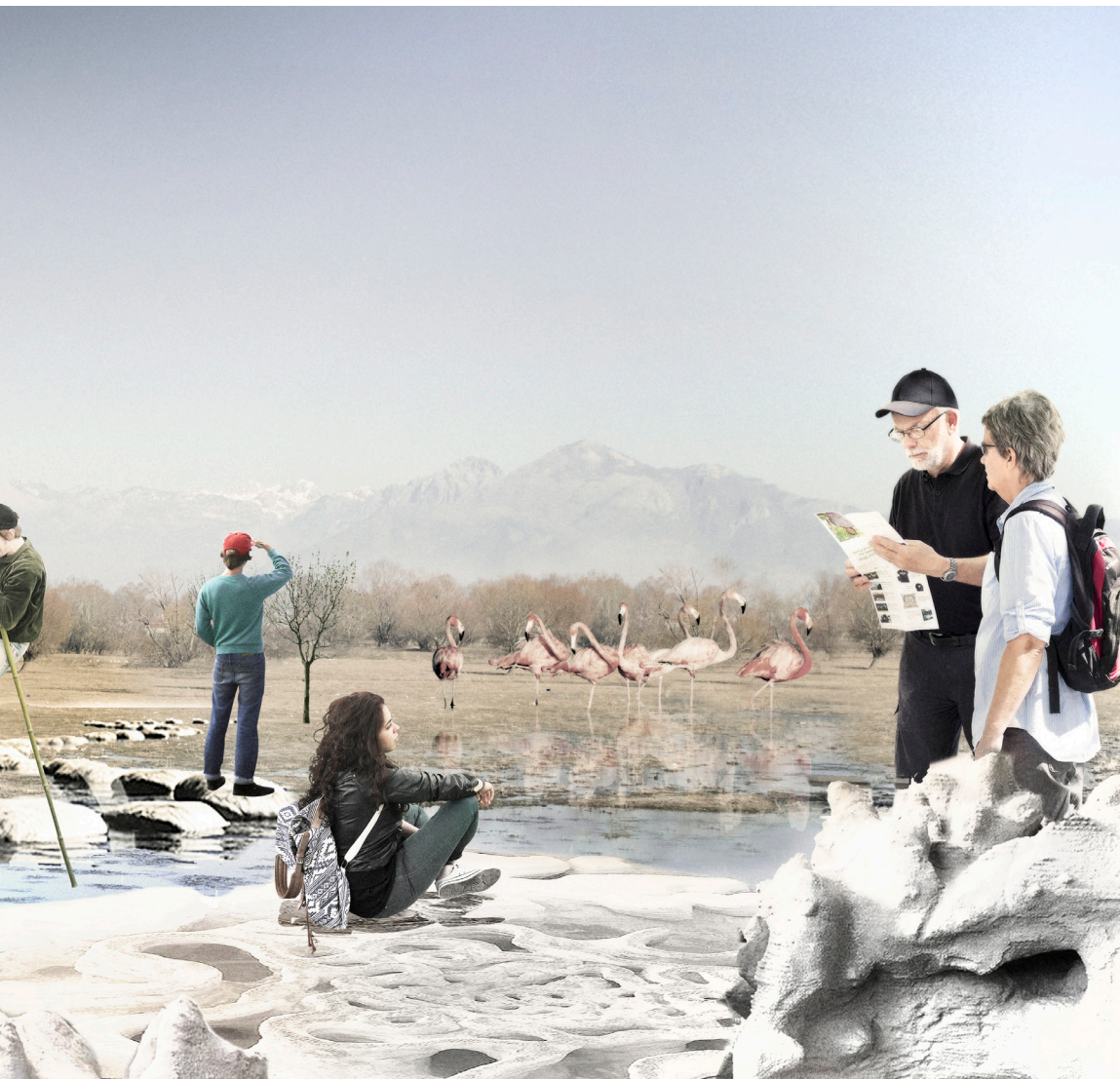
Fig8 / Project proposal for the shoreline of Shkoder's Lake, composed of 3D printed landscape components made of a stone-like material mixed with local sands and realised through powder-bed deposition processing. The walking paths and the organic-shape reefs contribute to create a soft biomimetic infrastructure, compatible with the character of the natural protected area

Municipality of Shkoder, (2005) Strategic Plan for Economic Development 2005 – 2015, Maluka sh.p.k.