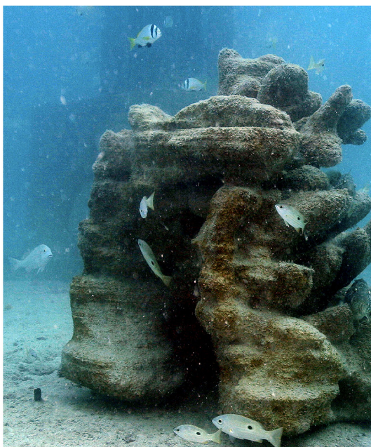
Fig6 / Reef prototype and its experimental positioning underwater. It represents a natural habitat for the aquatic ecosystem. The geometric layout is also effective to strengthen the morphology of the coastal margin

waste reduction) in order to find a new market segment between the artisan and the mass production (Sennett, 2008). Several companies have therefore developed printing machines for building construction, to perform pioneering experimentations encouraged by the fact that beyond the initial investment to buy the machine, any tests are feasible only considering the price of the material, which is the major cost component (Rindfleisch, 2017).