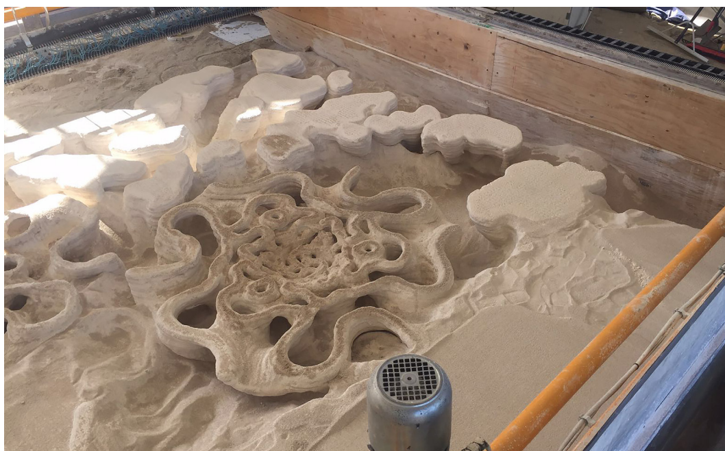
Fig3 / 3D printer that works with powder-bed deposit. It allows the definition of free-form volumes in any direction. The printing resolution is variable according to the features of the machines

In Europe, plurennial strategic programmes play a key role to encourage aquatic ecosystems protection, green networks realisation, energy consumption optimisation and sustainable tourism promotion. The programmatic agenda includes the EUSAIR (European Strategy for the Adriatic and Ionian Basin) for the monitoring of coastal areas in the EU Member States as well as non-EU Countries, in order to strengthen the quality of the whole geographical territory. The EUSAIR programme embraces several complex systems of the Balkan Peninsula, such as the watershed of Lake Shkoder and River Buna (counted in the Ramsar List of Wetlands of International Importance ), which is strongly affected by unsustainable land-based activities on shoreline areas and aquatic ecosystems. It is considered a significant context to be taken as a case study. [Fig.3]