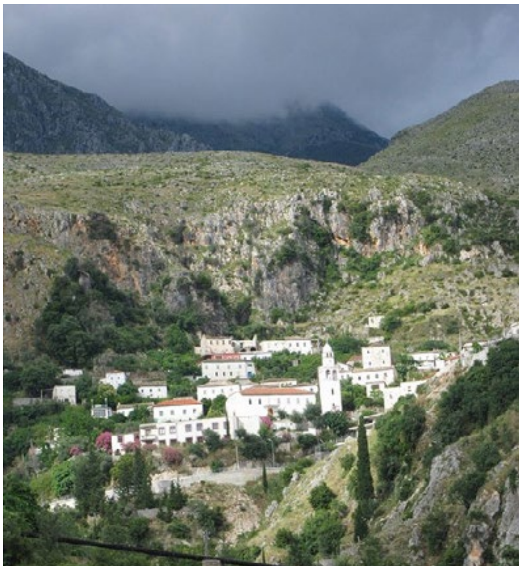
Fig7 / Dhermi village source / PhD international workshop students

Routes/Default_en.asp [Accessed 15 May 2015].