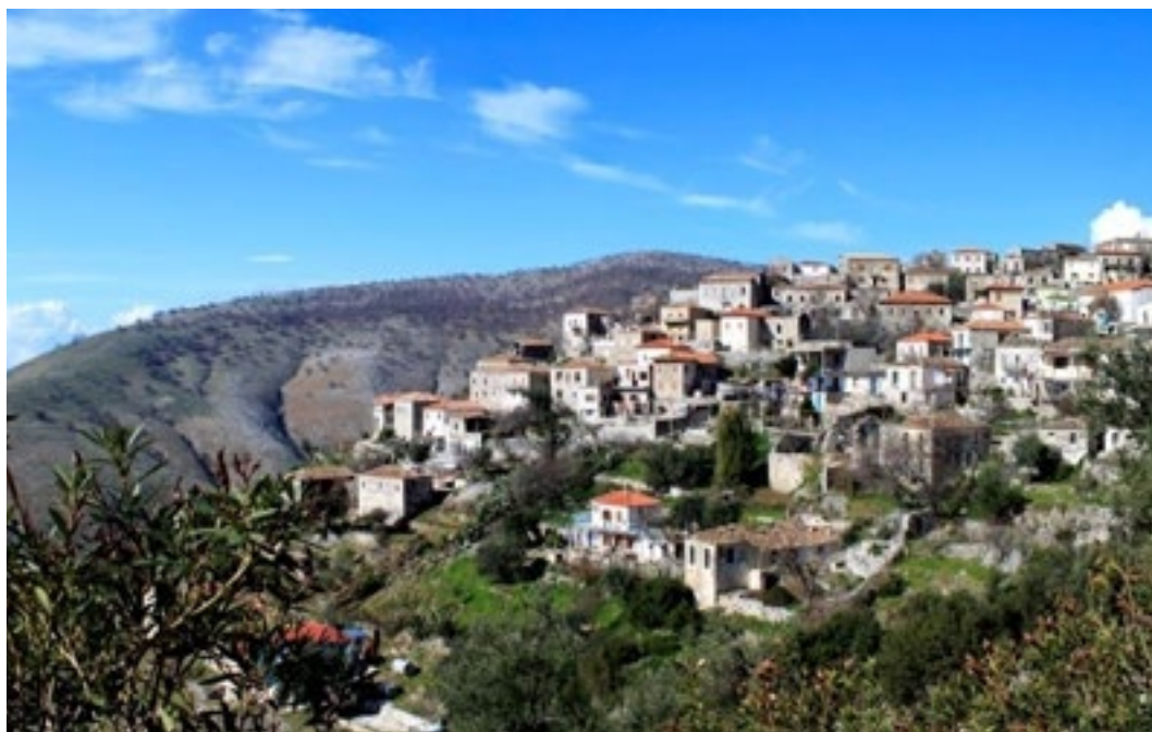
Fig3 / Village of Upper Qeparo

Slovenia is currently participating in the following Cultural Routes activities and present projects: