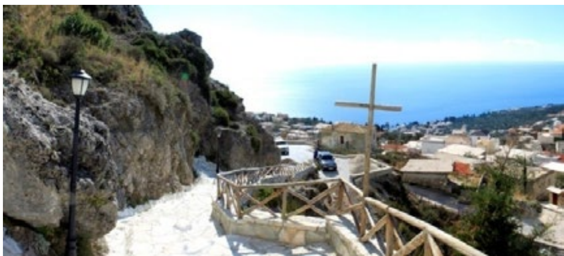
Fig2 / Village of Dhermi

interculturality in those places. The narrative of tourism therefore links place and journey, local and global, dwelling and mobility, host and guest. (WTO, 2014)