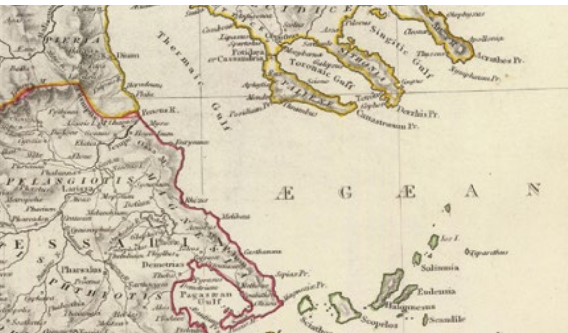
Fig5 / Map showing Kemera and Bouthroton towns within the region of Epirus. Two major centers of the Greek tribe of the Chaonians

drop in touring holidays and rural tourism, and a 15% fall in mountain recreation in 2009 11 . (International Tourism Consulting Group, 2013). This statistics indicated that despite the study's suggestions carried out in the Albanian Riviera, there is still a need for implementing new trends of cultural tourism, such as – creative tourism; – educational tourism; – gastronomic tourism; – religious tourism; – spiritual and holistic tourism; – wellness and spa tourism; – cultural volunteer tourism; – roots of migrant tourism,