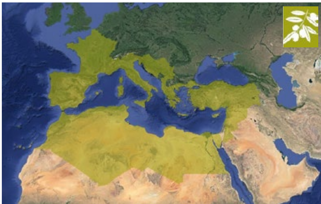
Fig6 / Countries involved in The Routes of the Olive Tree Programme

Cyprus, Croatia, Egypt, France, Greece, Italy, Jordan, Lebanon, Libya, Malta, Morocco, Portugal, Serbia, Slovenia, Spain, Syria, Tunisia, Turkey share "The presence of the olive tree that has marked not only the landscape but also the everyday lives of the Mediterranean peoples.