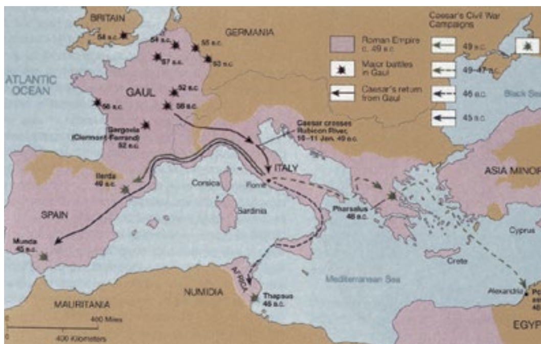
Fig4 / Map Showing Julius Caesar's Military Career in 49 – 47 B.C passing through south of Albania during his pursuit of Pompey

promoting events as means of advertising places as more creative spaces for originality and user-generated content. The importance of cultural tourism is the development of a narrative about a place in which both locals and tourists dwell, but also its ability to develop narratives about the individual tourists who go through and experience interculturality in those places. The narrative of tourism therefore links place and journey, local and global, dwelling and mobility, host and guest. 8 (International Tourism Consulting Group, 2013)