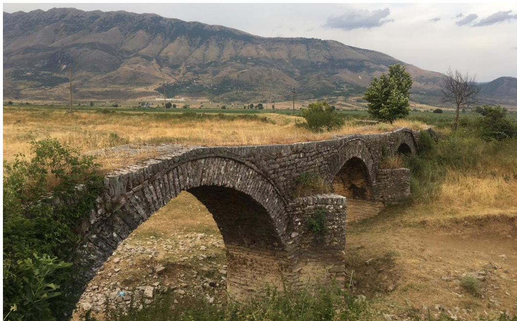
Fig. 2 / Dropull municipality Process of General Local Plan, 2018. Source / General Local Plan of Dropull Municipality