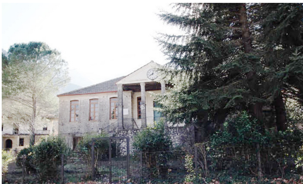
Fig. 1 / Dropull municipality Process of General Local Plan, (2018).