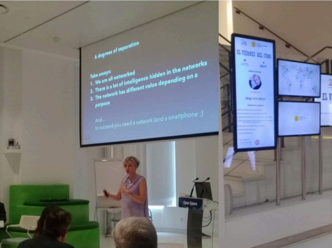
Fig. 3 / Network Thinking.