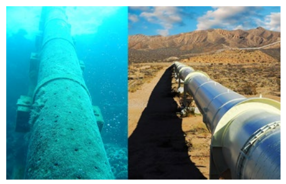
Fig3 / the Trans-Adriatic Pipeline (TAP), under construction, will connect with the Trans Anatolian Pipeline (TANAP) at the Turkish-Greek border at Kipoi, cross Greece and Albania and the Adriatic Sea, before coming ashore in Southern Italy

only be effectively faced if we consider such environments, in their process of evolution, as a result of the continuous interaction between humans and nature.