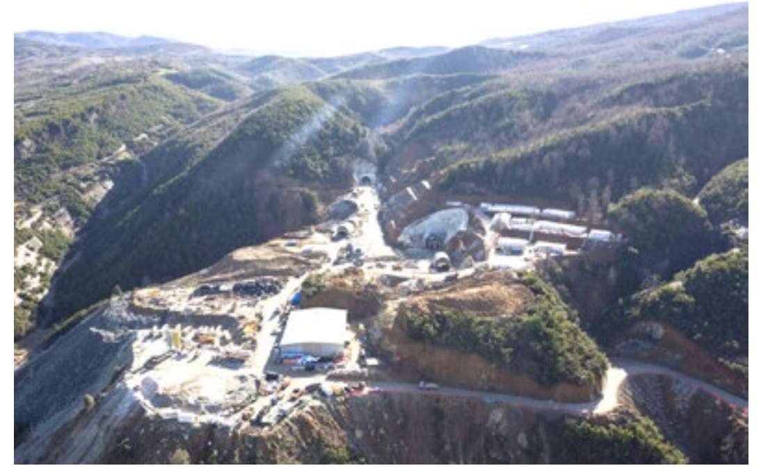
Fig1 / the New Highway Tirana - Elbasan under construction from KLM 2+850 (distance counting starting from Tirana) up to the Entrance of the Krrabe Tunnel KLM 15+650

to develop the "hyperNatural" attitude and re-design the future landscape as something new and original.