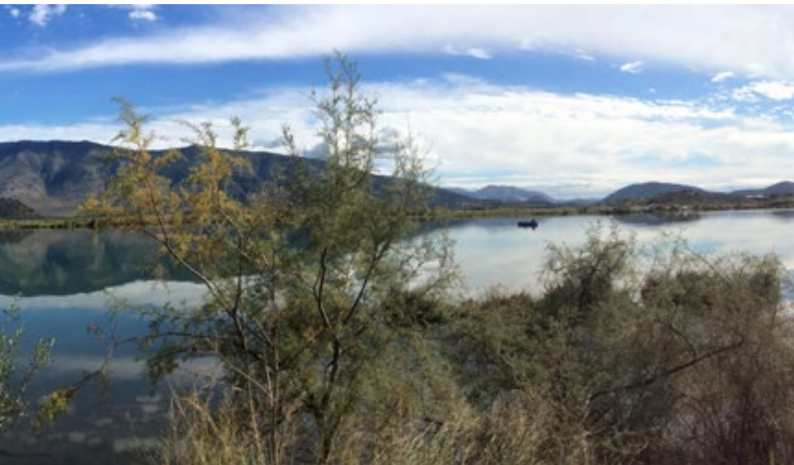
Fig2 / Albanian Riviera source / PhD international workshop students