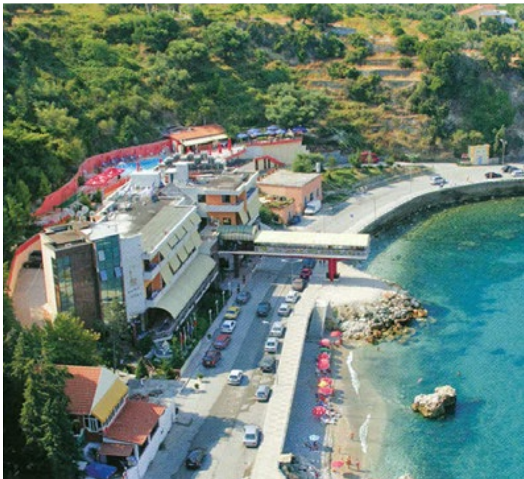
Fig3 / Vlorë waterfront

(sometimes also demolishing structures of low quality, as already done by the government for a lot of constructions built illegally along the coast). Starting from this premise, the new project wants to favor such characteristics, adapting to the signs of the area and interpreting the