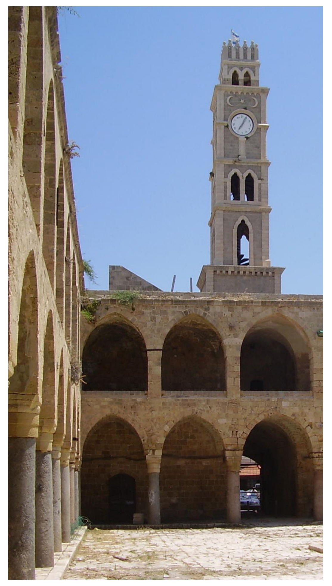
Fig. 2 / The Ottoman Al-Umdan khan, Acre. Just like the two-story customs house of the Kingdom of Jerusalem described by Jubayr, whose site it rises upon, the kahn provided warehouse spaces at the ground floor and a hostel for the lodging of the incoming merchants at the upper floor.