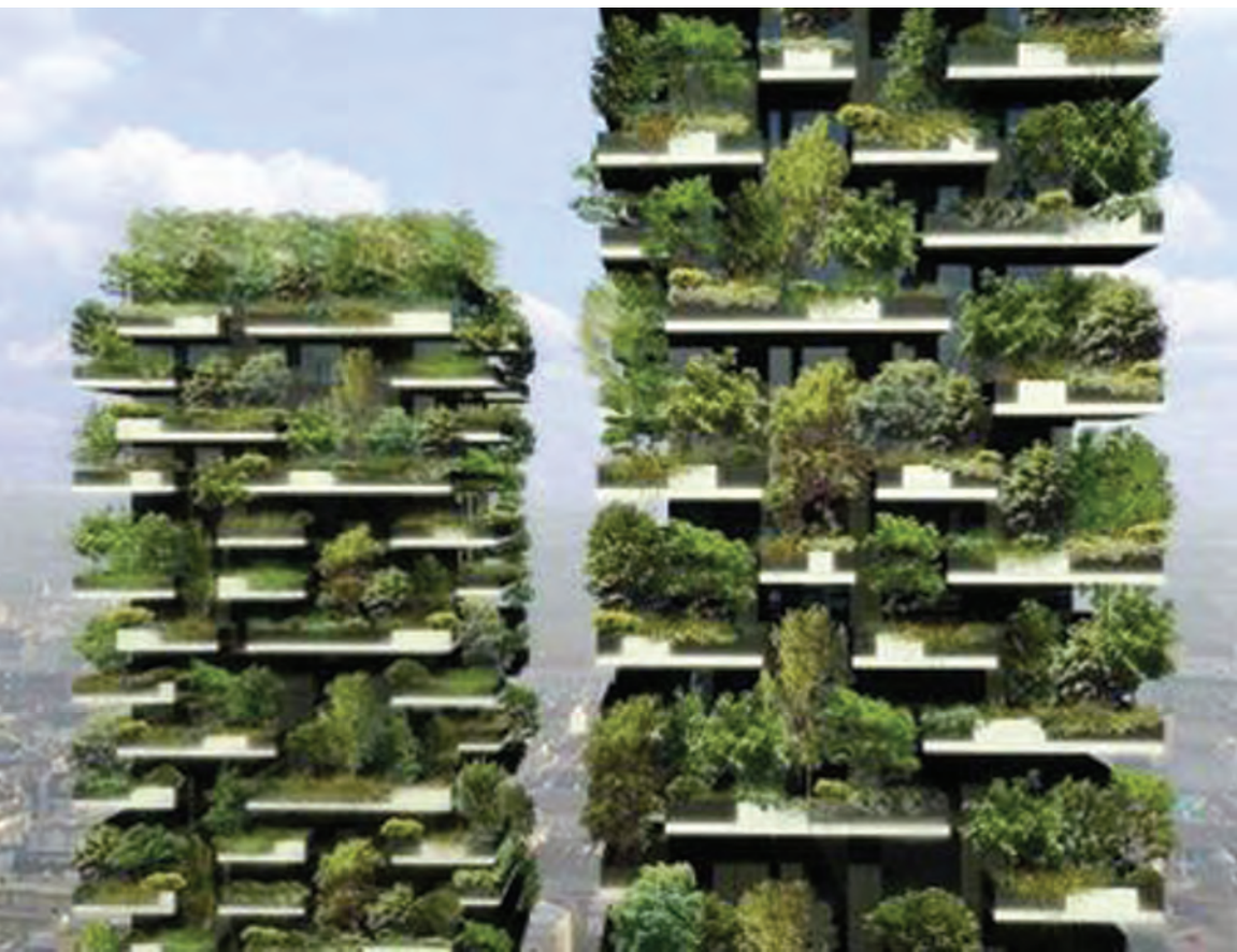
Fig.4. Vertical woods, Stefano Boeri, Milan