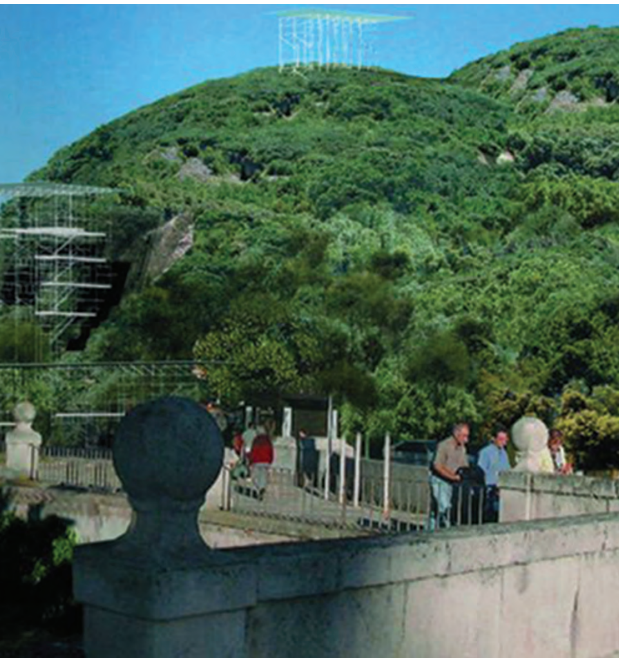
Fig.5. Atelier Jean Nouvel, competition design for a Museum in Burgos, Spain

the social particularity of the metropolitan condition of Tirana: a metropolitan area developing in between being a city established in the national territory of Albania, but still with major margins of development, and therefore still to be defined as a sort of virgin land where similar European contexts can be viewed as a learning experience the same mistakes of which must be avoided and to experience the new dimensions of the contemporary urban living described above. Among others is the decision to focus on the area between the city and the airport is not accidental: in all the contemporary metropolises, the development between these two poles represents the strategic junction of development in a vision of the global net-