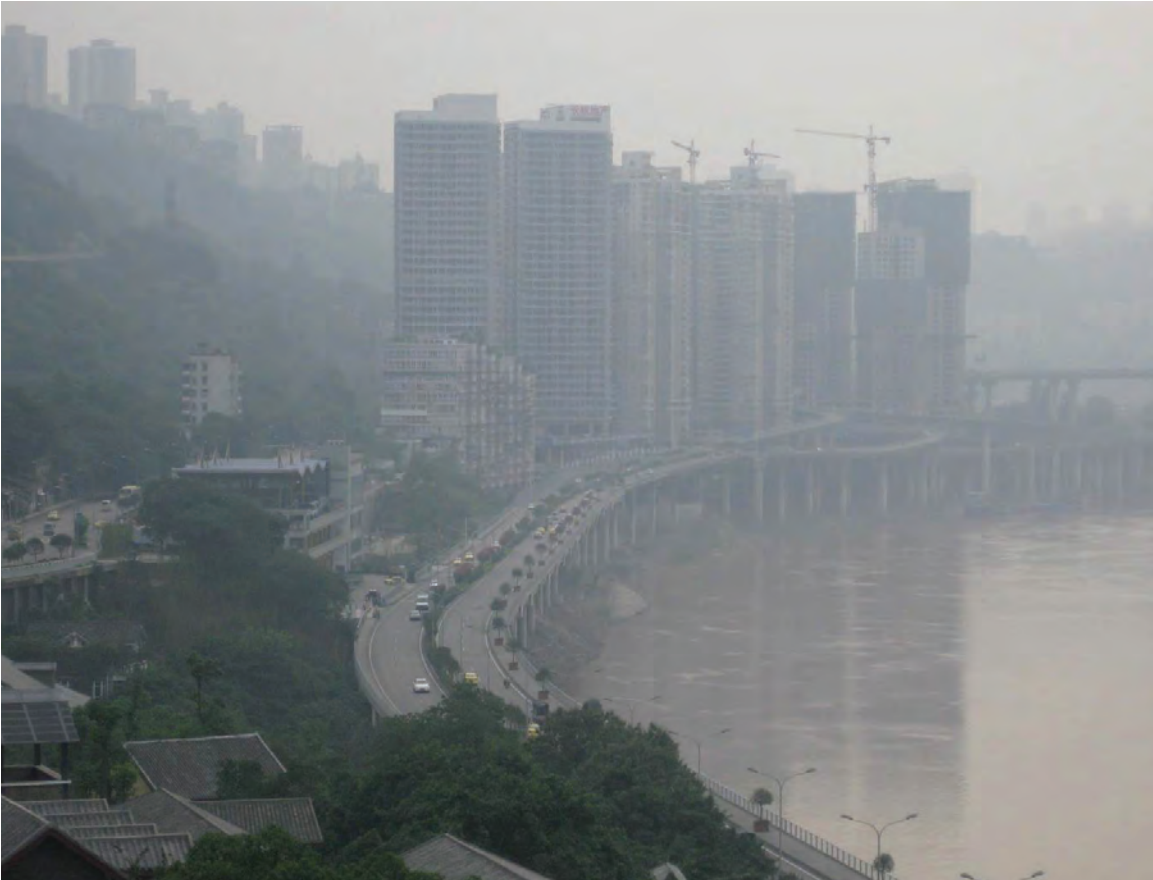
Fig. 3. Chongqing, China, 2009

the development of the western metropolises of the XIX (nineteenth) century up to the contemporary and even more abnormal development of the eastern city, particularly Asian and, specifically Chinese (Fig. 3), shows us the infrastructure of the city in the near future, rather than its original structure made of "full and empty spaces populated by man", one of the elements of most interest and attention from the urban planners' perspective. Certainly, it has to pass from a monocentric idea of the city to a polycentric idea, namely a city that has built some pockets not necessarily inhabited, in the strict sense, by the inhabitant, but rather just crossed by the same. And as if inserted in the traditional differentiation between city and landscape, a third dimension emerges without internal clear limits that contains them both, and where the transport infrastructure becomes the key element of the structure of the city. To visualise this idea, think, for example, of Los Angeles or many Chinese and Asian metropolises.