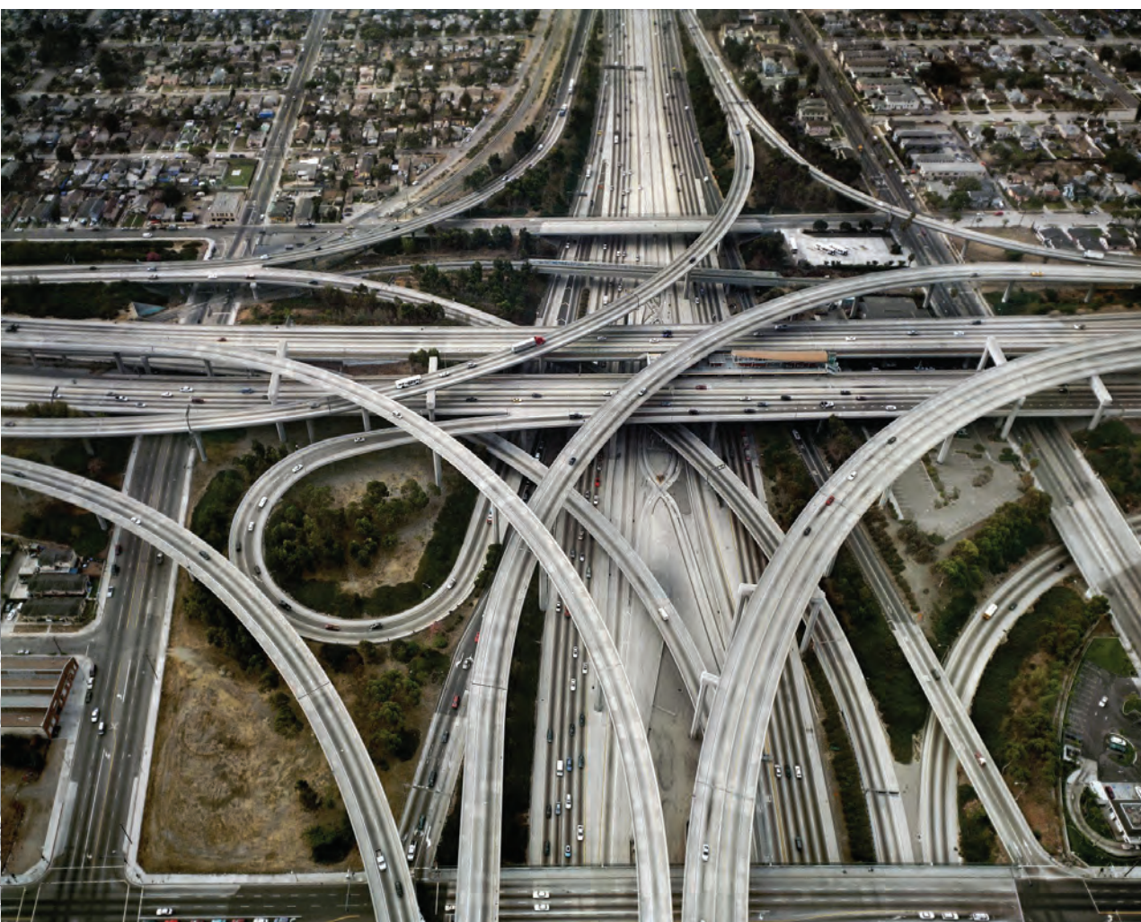
Fig. 2. Motorways, Los Angeles '70