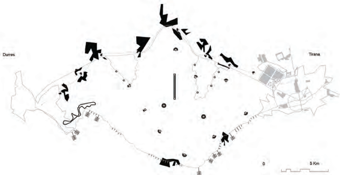
Tirana MetroPolis, Berlage 2003