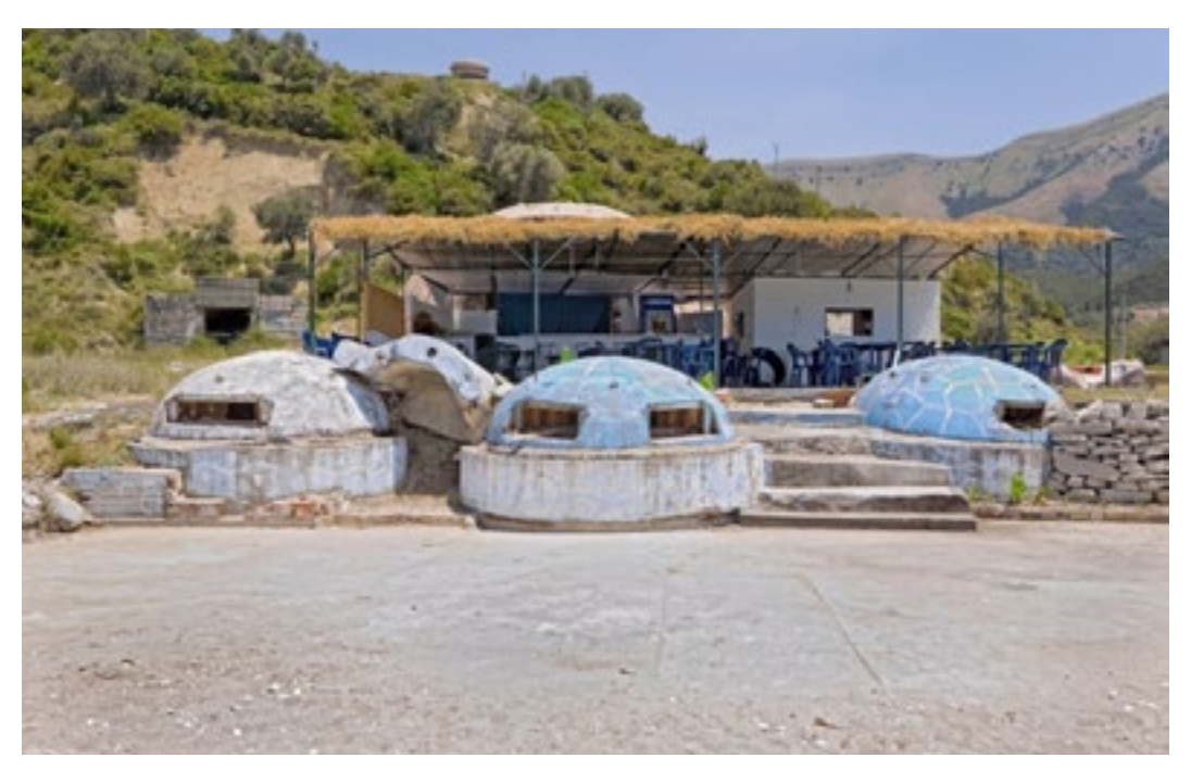
Fig2 / Buneci Beach Bunkers, the reuse process

bunker. These bunkers were transported and are assembled onsite through large machines built for this purpose, capable of lifting these reinforced concrete parts despite their heavy weights. Each bunker is a combination of three main components: a semi-sphere (or dome) of a diameter of 3 meters with an opening that serves as a gun turret; a cylindrical foundation below to support the dome that is partially embedded in the ground; and an outer wall with a radius roughly 60cm larger than the foundation cylinder that is filled with soil. It should be noted that these bunkers are, relatively, all small bunkers. These small bunkers were originally designed to host a single soldier. They are generally found in lowlands and are especially prevalent along the Albanian Riviera. In these areas, they usually exist groups of three, connected to each other by a tunnel (Stefa and Gyler, 2009).