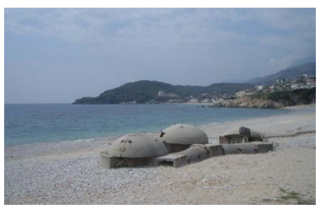
Fig1b / Dhermiu Beach Bunkers

concrete is sufficiently high and then immediately pouring cold water on the surface of the concrete until it breaks apart, the smaller pieces rendered easier to remove. This process is repeated until the bunker can be taken apart in pieces. An arduous process to be sure, this process is undertaken only for the most inconveniently placed bunkers (ACI)