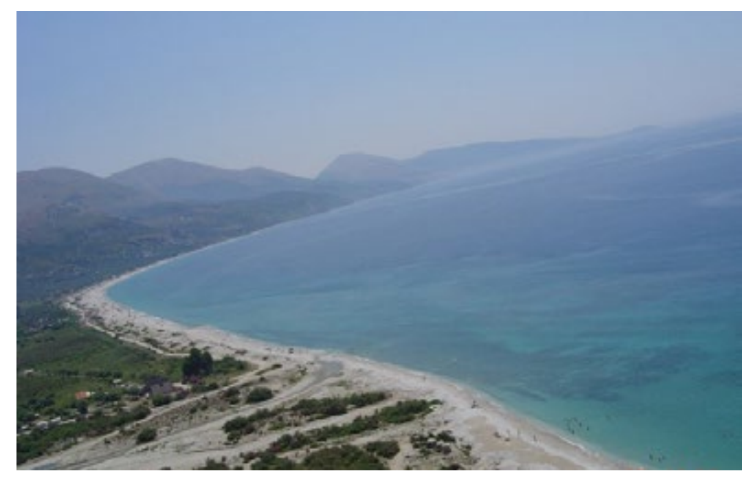
Fig4 / Riviera Beach Bunkers