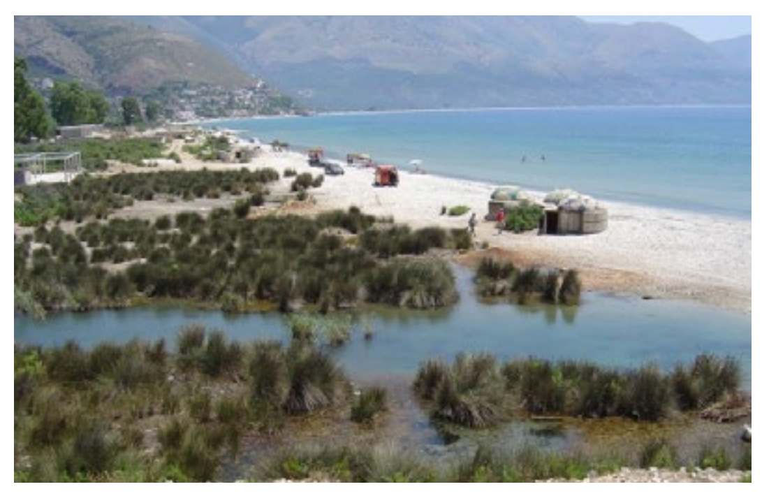
Fig3 / Riviera Beach Bunkers

Despite such examples, however, most bunkers found in the Riviera area are not reused or revitalized and remain abandoned. These, then, might be repurposed in similar ways to those mentioned above, or perhaps in other ways yet to be imagined. That is why we can forecast several possible ways of transformations