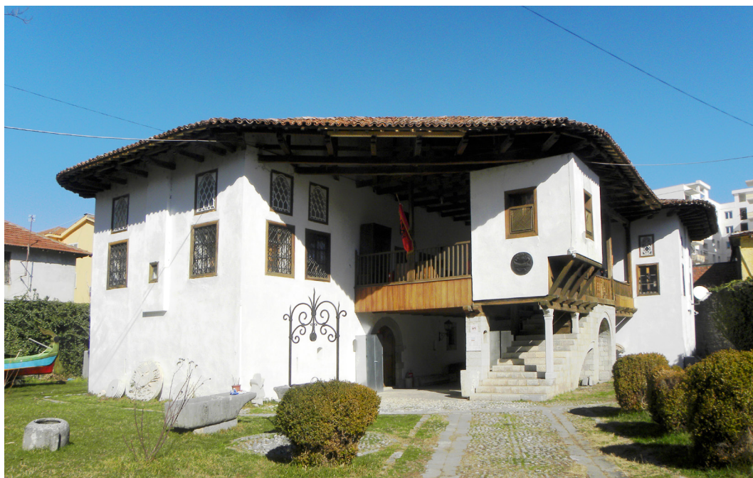
Fig6 / Shkodra historical house, now becomes the city's Historical Museum

identity could be proposed and divided after the recognizing of common elements, trying to define different and precise line of interventions to optimize and reduce built energy consumption, providing for instance an improvement in thermal insulation, the replacement of fenestration systems with better performing ones (by using, for example, Insulated Glazing Units energy consumption can be significantly reduced) as well as the installation of renewable energy systems such as thermal solar and PV panels.