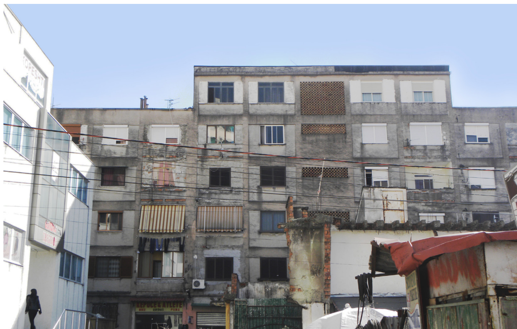
Fig5 / Existing housing stock in the inner city of Shkodra

as the loss of identity of these places.