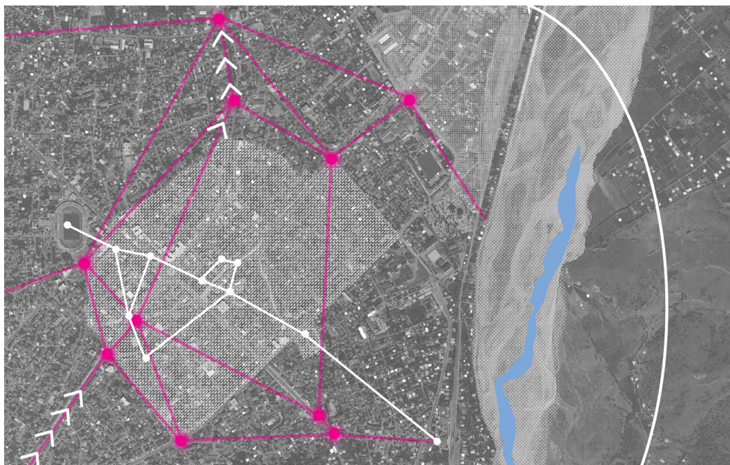
Fig3 / City plan concept after proposed intervention's strategies: in the 1:5000 map the three main areas analyzed have been indicated (the historical city, the watershed area and the informal settlements), the proposal of the infrastructural bypass and the improvement of the existing pedestrian routes through the city center (thanks to the enhancement of residual spaces as well as the linkage between the main city squares).

exactly the city center, analyzing its urban pattern, the traffic and pedestrian routes and the vocational capacity of each area taken into account.