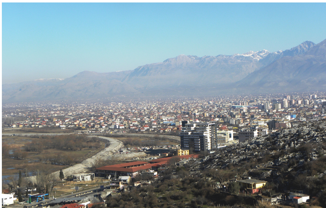
Fig1 / Areal picture of the city of Shkodra taken from the Ruzafa Castle