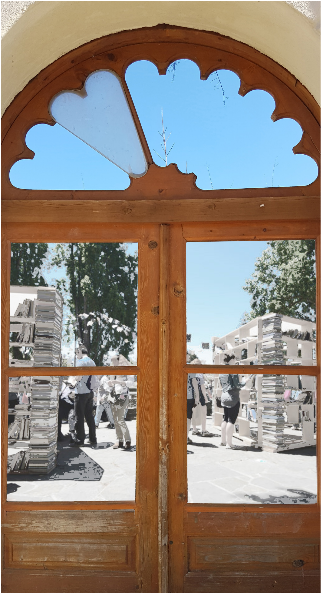
Fig8 / Author's photo-merge that provide a suggestion about the proposed public spaces' uses