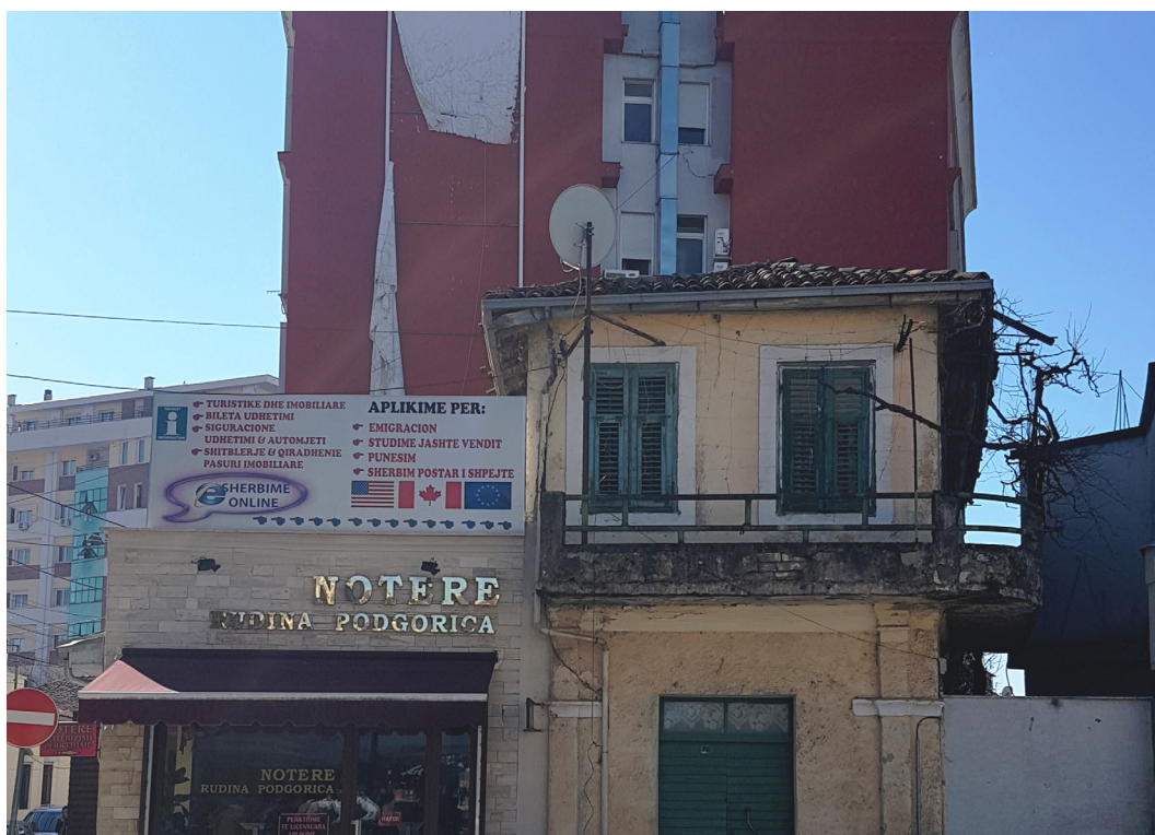
Fig4 / Existing housing stock in the inner city of Shkodra

state of repair; also referring to historic homes, just few within the central area have been restored, while several was torn down, ignored or renewed in modern styles. During the communist regime indeed, as much as after the Second World War, the common idea was that any ancient construction had a small value; this, in addition with the economic and social pressure on the inner city, led to a great elimination or alteration of the older housing stock.