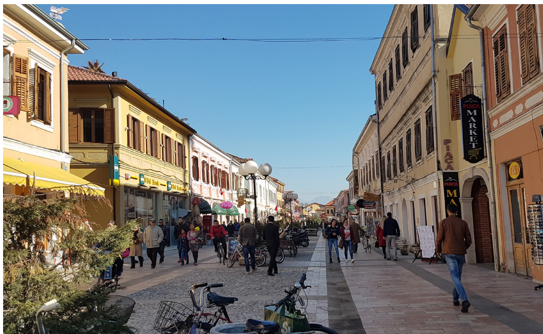
Fig7 / Current aspects of the pedestrian area along Kol Idromeno street after the re-pavement occurred in the last years