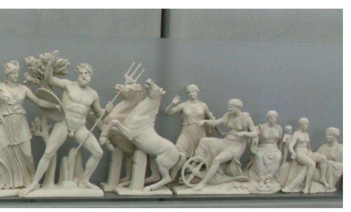
Fig2 / Reconstruction of the west pediment of the Parthenon