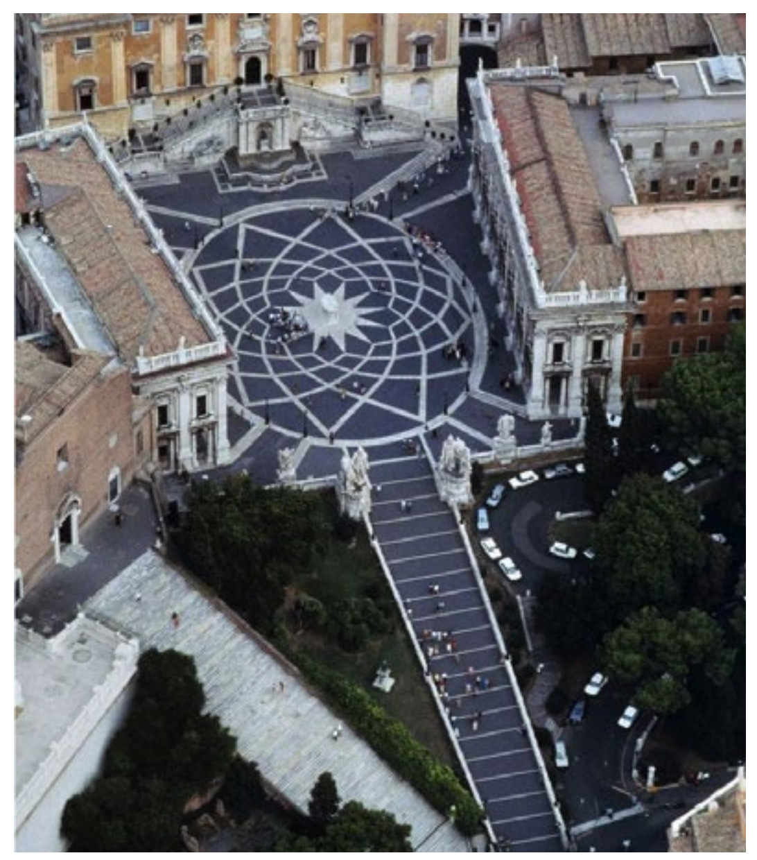
Fig5a / The staircase of Campidoglio square - Michelangelo Buonarroti 1548