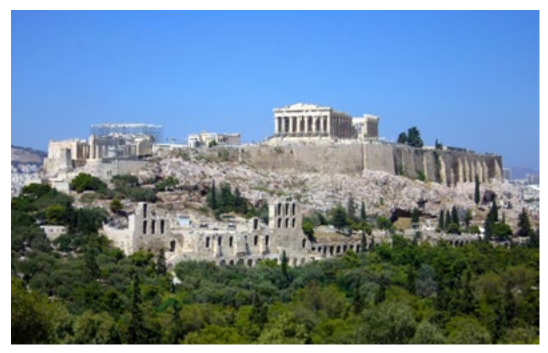
Fig4 / Acropolis View Athens