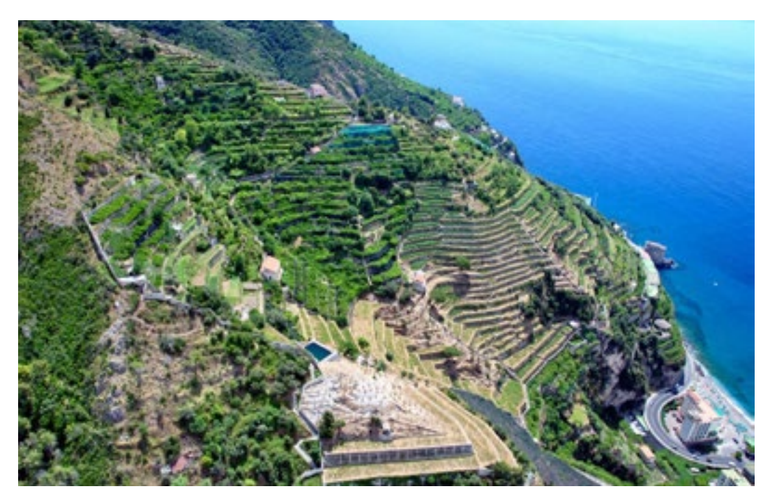
Fig5b / The Amalfi Landscape Italy

can offer a new perspective, one centered on building and a high sense of community (BOTTA, 2010).