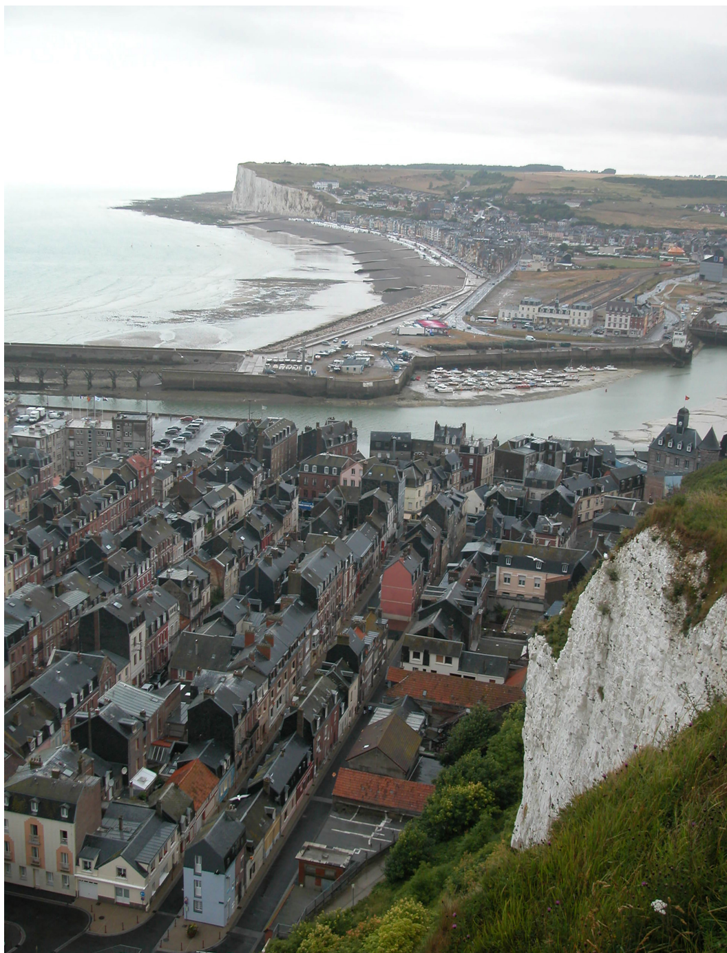
Fig4 / Le treport (Francia)

can say that the idea of an ideal city, feasible even for parts like this, was no longer "thinkable" and probably won't be for a long time yet, unless we discover a new paradigm at the moment not yet on the horizon. After the first hard impact with the "foreign body" of the machinic reality, the city, as the human body reacts with its own metabolism and antibodies in rejecting the foreign body and regenerating itself, has reacted in recent decades (one could say to starting from the end of the Second World War in the Western world) starting right from