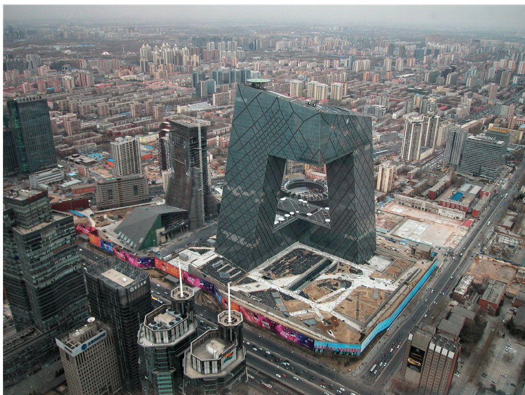
Fig6 / Pechino

In this sense the case of Prishtina is certainly a city that could well represent, in a translated and metaphorical sense, the "liquidity" of which Bauman treats. This is due to its characteristics of a city that is anything but dense and devoid of a single polarity but with different and multiple internal polarities, in many cases more connoted as empty than full urban ones, think for example of the library area, which they make it an excellent testing ground for this new approach to urban regeneration and transformation.