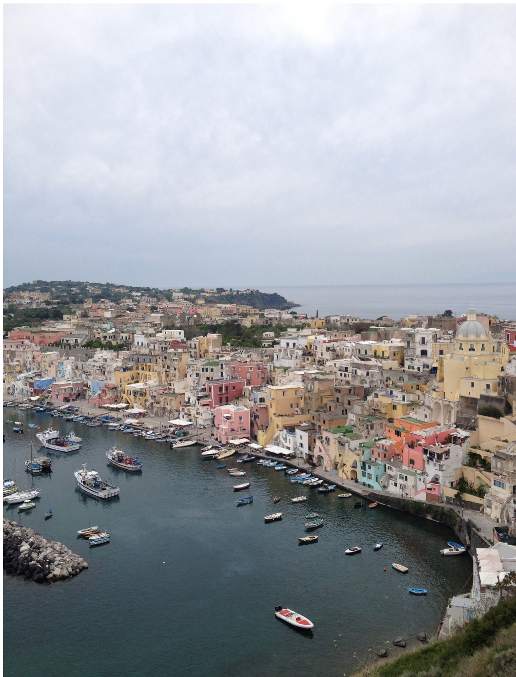
Fig3 / La Corricella , Procida (Napoli,Italia) Source / author

The city excerpts made according to the dictates of these great examples of modern cities, especially in the case of Le Corbusier and Hilberseimer, (Hilberseimer L. ,1927) have indeed given the impetus, with their failure, to the final renunciation of the modernist ideal and it is no accident that the post-modernity in architecture is emblematic starting from a precise event concerning the demolition of the residential complex of Pruitt Igoe built between 1954 and 1955 according to the dictates of the ideal cities mentioned above, by one of the