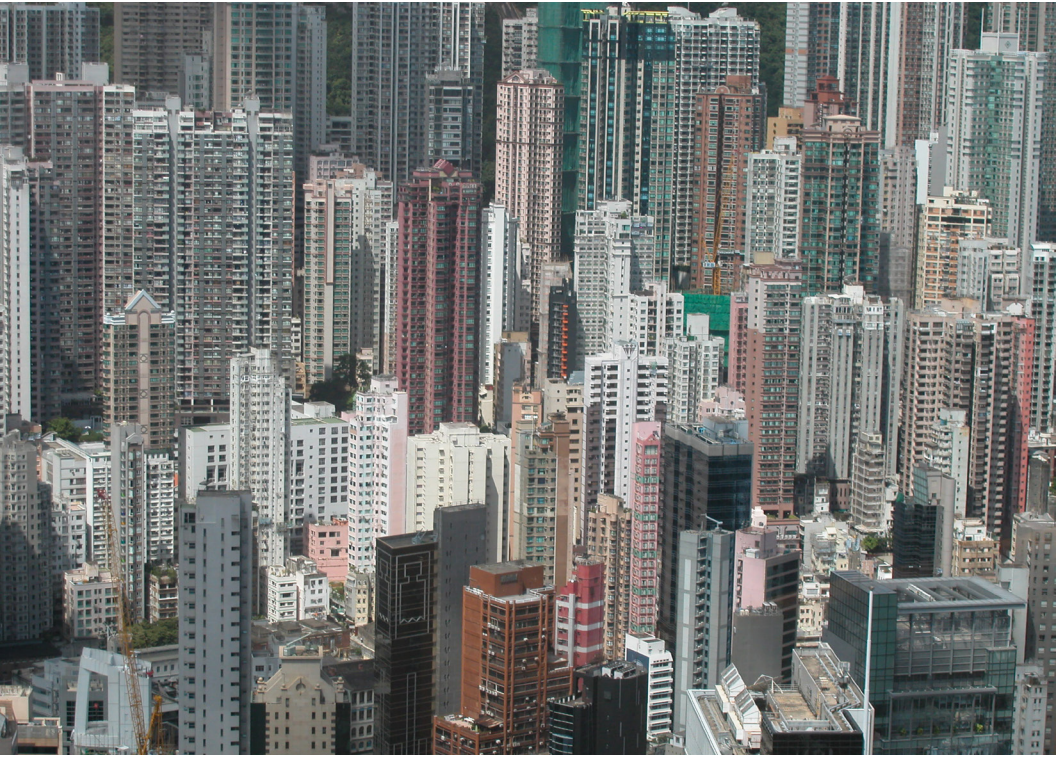
Fig2 / Honk Kong

discussed above, but necessary in order to be able to establish the specific projects that have been developed specifically in the second part of the course that is the subject of this review. Indeed, to maintain that the contemporary architect is no longer able to dominate the city as a whole from a theoretical point of view, necessarily having to take refuge in the project of its singularity, reducing in some way the scale with which to face urban complexity, does not mean giving up the reading of "urban phenomena", again to use a Rossi's category.