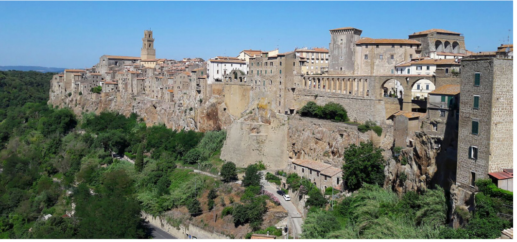
Fig7 / Pitigliano (Italy)

global direction of future development of our cities.