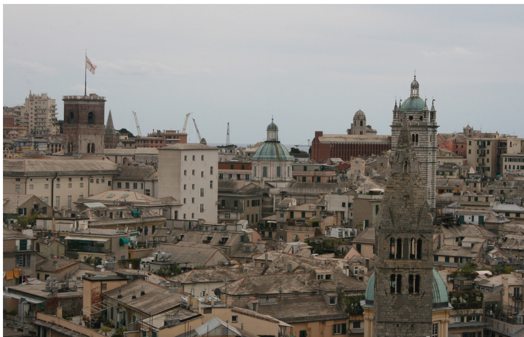
Fig1 / Genova

great story of the city, in post-modern society, was theoretically abandoned in favor of a fall back on the city seen as a simple summation of architecture (small stories). If the man of post-modernity is no longer able to face and conceive a new great story, unlike his modern predecessor, the architect of post-modernity is no longer able to understand and govern the processes of transformation of the city as a whole and coherent organism.